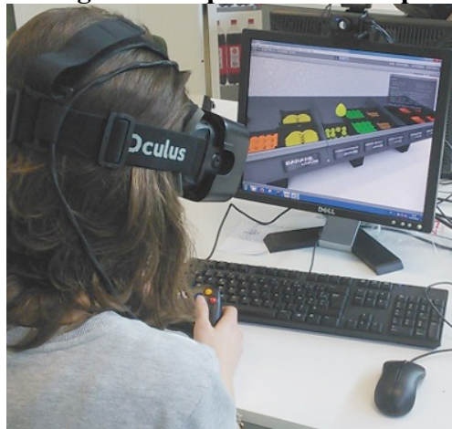
Figure 5: Experimental setup

Finally, we will seek your opinion on the offer of fresh fruits and vegetables in this “Super U”’s shop.