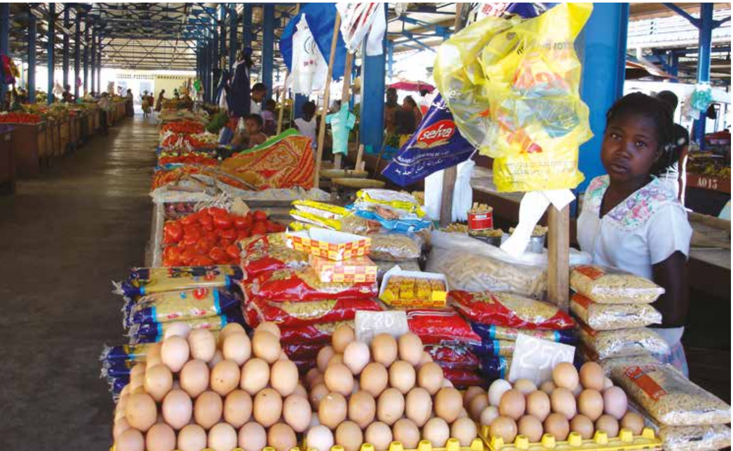
The Mahabibo Market in Mahajanga after its renovation. Benjamin Michelon.