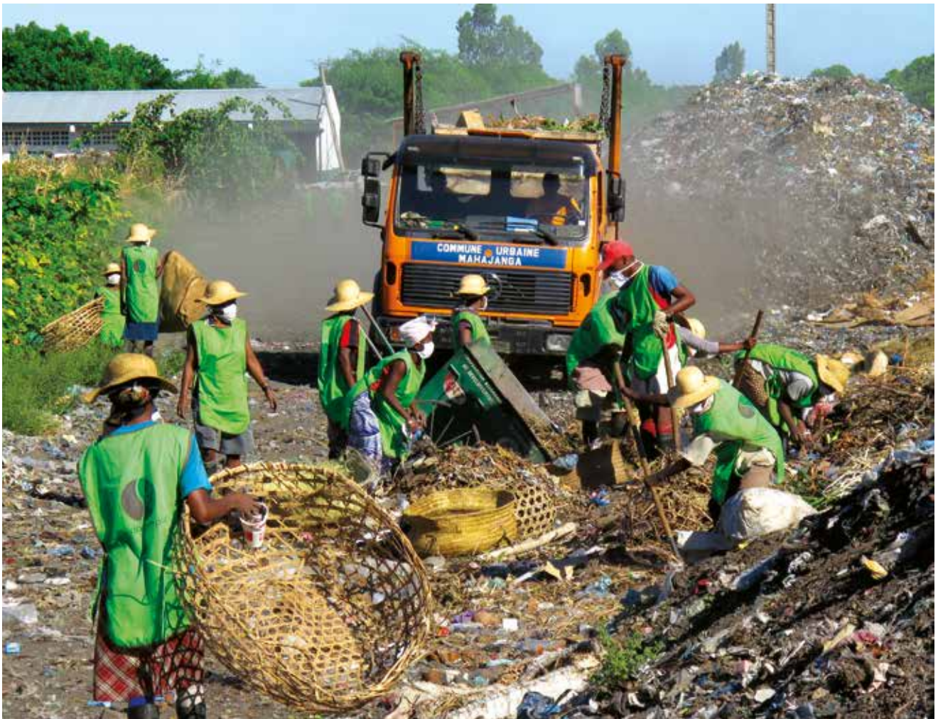
Africompost Project workers at the Mahajanga composting facility. © Gevalor.

This early Gevalor project has been supported since 2001. Its composting facility is operated by MADACOMPOST, an LLC that also recycles slaughterhouse waste and plastic bags