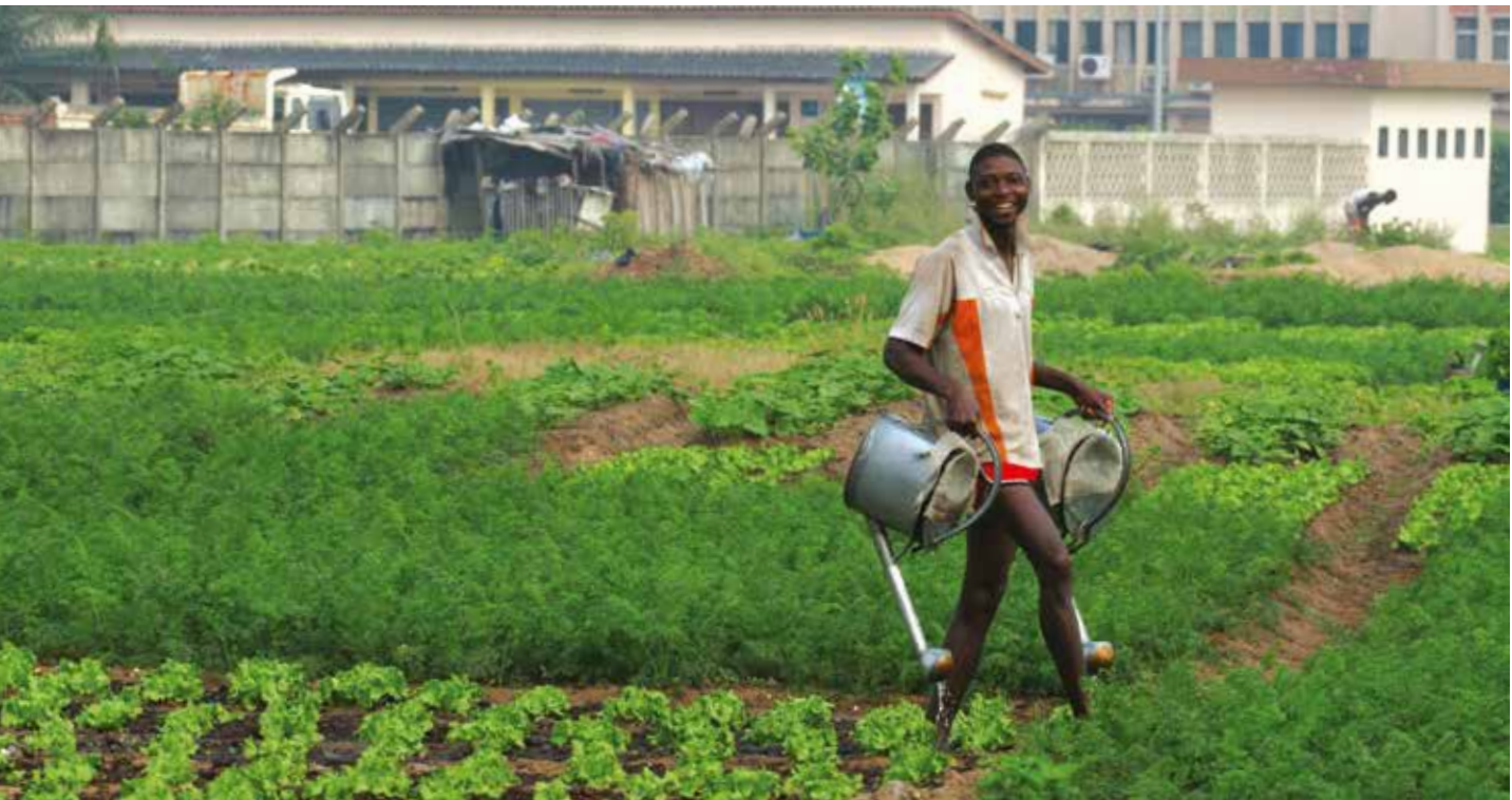
Urban market gardening in Cotonou, Benin.

An FAO report based on numerous case studies of urban and peri-urban agricultural practices shows that this activity is very important in such areas. It is practiced by 35% of the population in Lilongwe, Malawi and in Yaoundé, Cameroon; by 30% in Nairobi, Kenya (representing 1 million people); and by 25% in Accra, Ghana. These studies highlight the fact that it is above all women who are active, including in the associated trade activities. They represent 70% of the producers in Bissau, Guinea-Bissau, and in Brazzaville, Congo (FAO 2012).