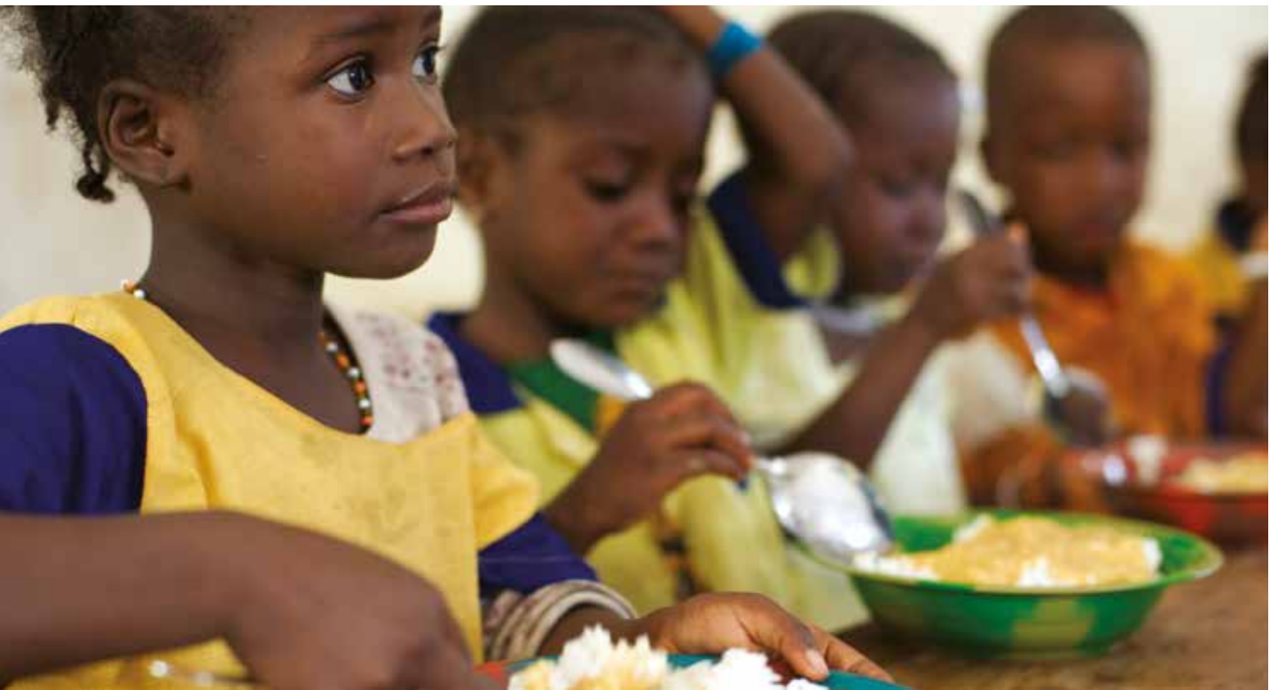
School meal program in Guinea. Julien Harnais.

Around the world, 368 million children benefit from school meals. Of these, 47 million are in East Asia and the Pacific, 121 million in South Asia, 85 million in Latin America and the Caribbean, and 30 million in sub-Saharan Africa (WFP 2013). The number of children benefiting from a school meal program in sub-Saharan Africa is much lower than the actual need. According to AFD, the capacities of local governments to set up school meal systems must be greatly strengthened there.