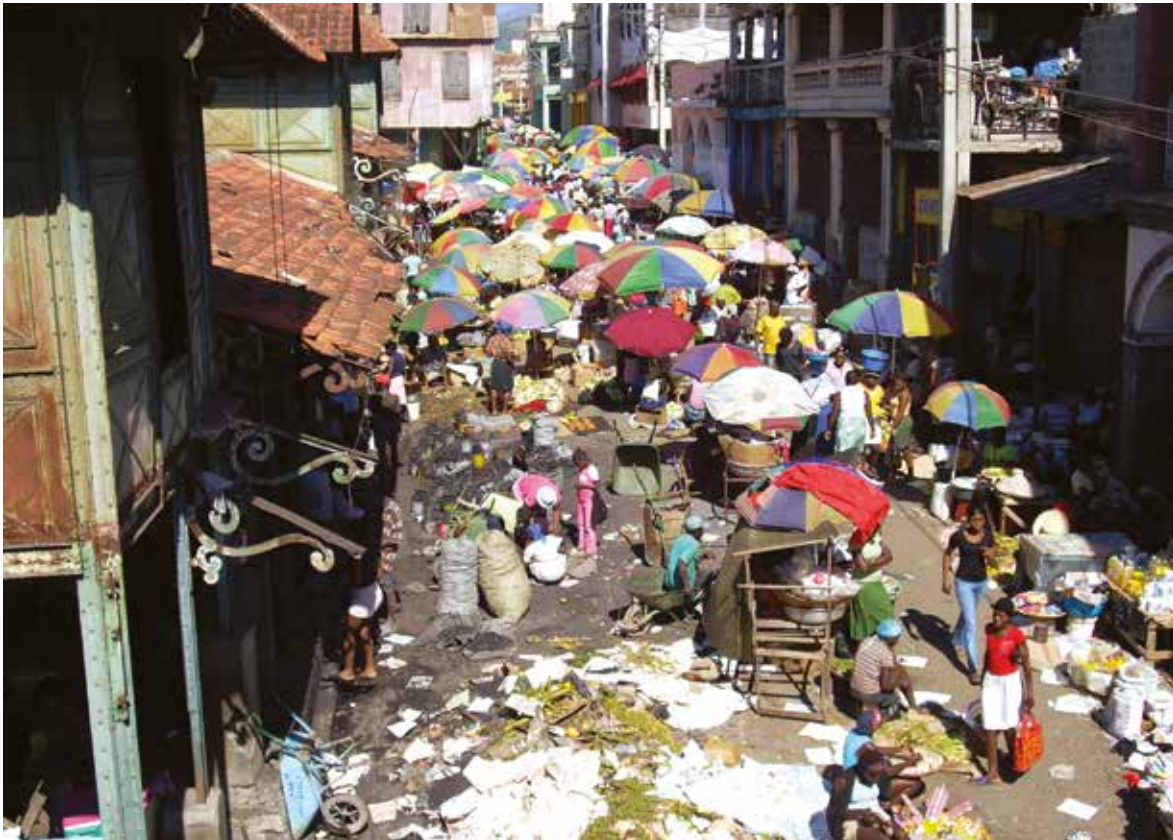
Congestion and waste created by an urban market in Haiti. Benjamin Michelin.

of markets and the safety of vendors, provide information about the markets, propose training, and make it easier to obtain loans (FAO 2000). Some cities encourage those involved in the informal food sector to organize in groups: they maintain a dialogue with their representatives and make them participate in the action programs that affect them. For example, the association of street vendors in the City of Cebu in the Philippines, which was founded in 1984 and unites 63 associations and over 7,000 members, dialogues regularly with urban authorities and has thus become a key stakeholder.