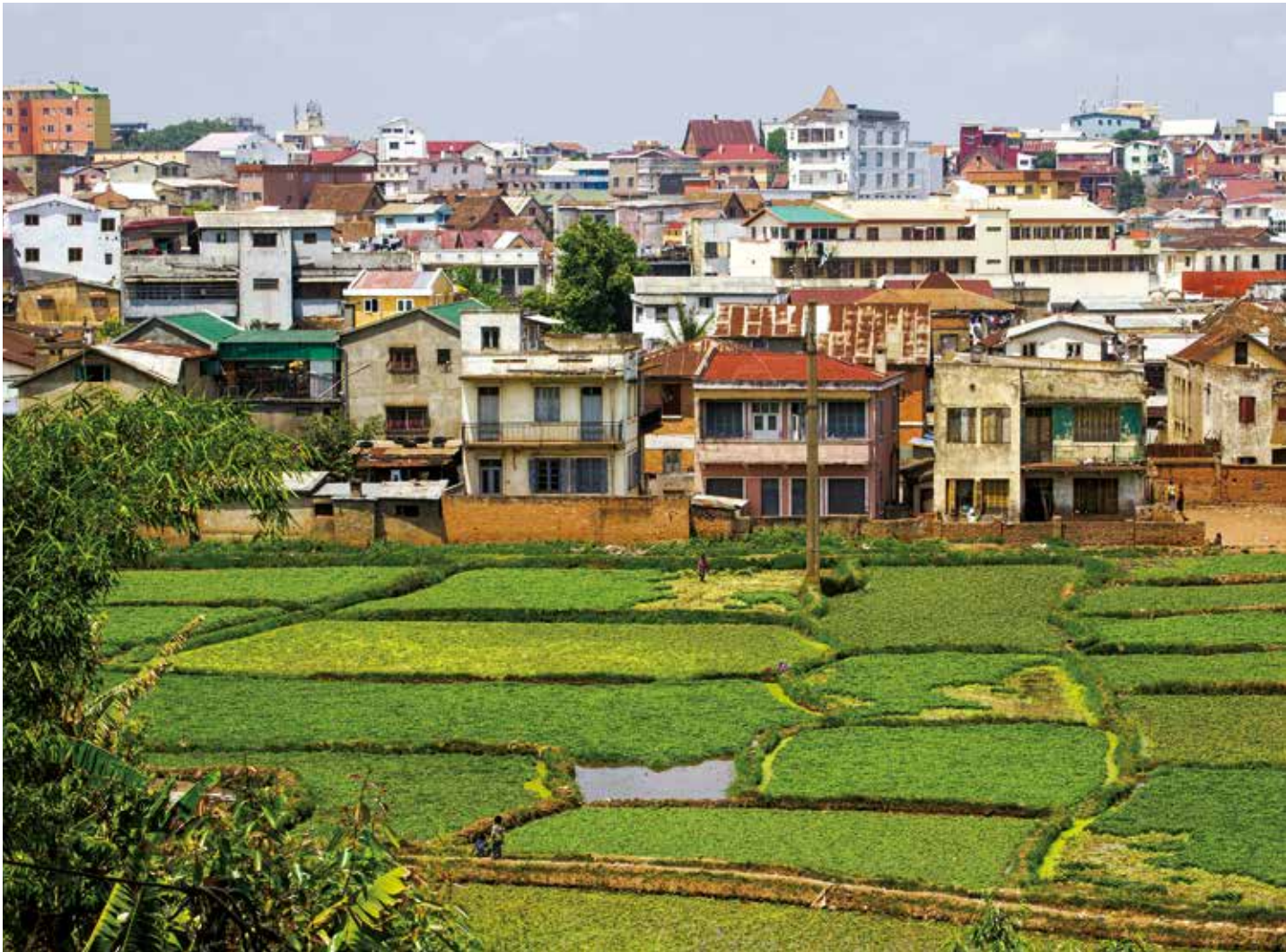
The working-class neighborhood Manjakaray in Antananarivo is bordered by rice paddies. Cyril le Tourneur d'Ison.

Urban and peri-urban agriculture alone do not suffice when it comes to feeding cities. Nonetheless, it is practiced by 800 million people the world (FAO 1999) and is complementary to “traditional” rural agriculture by providing a non-negligible share of urban consumption for some products: 80% of vegetables in Dar es Salaam, Tanzania, and in Accra, Ghana (Cofe et al. 2006), as well as 90% of eggs in Shanghai, China (Yi-Zhang and Zhan, 2000) and 20% of rice in Antananarivo, Madagascar (Aubry et al. 2014).