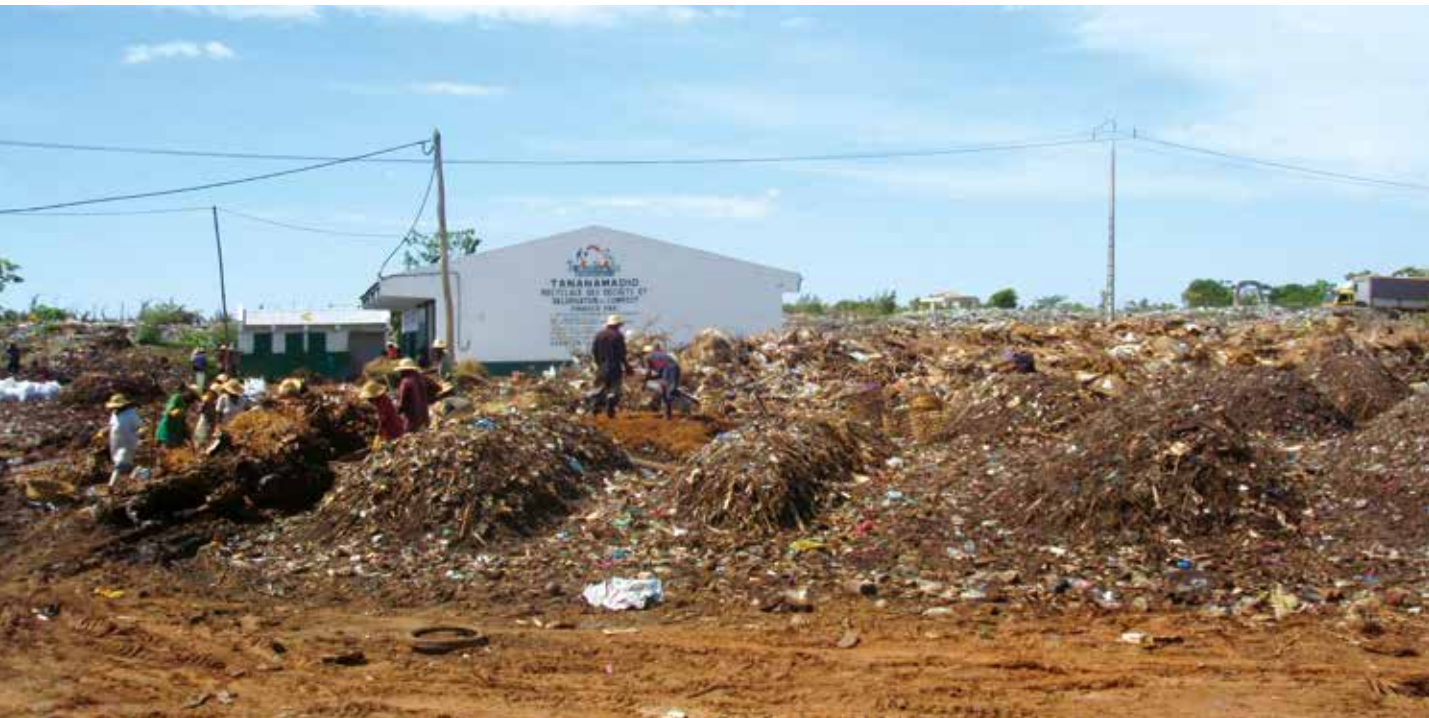
Composting municipal waste in Mahajanga, Madagascar.