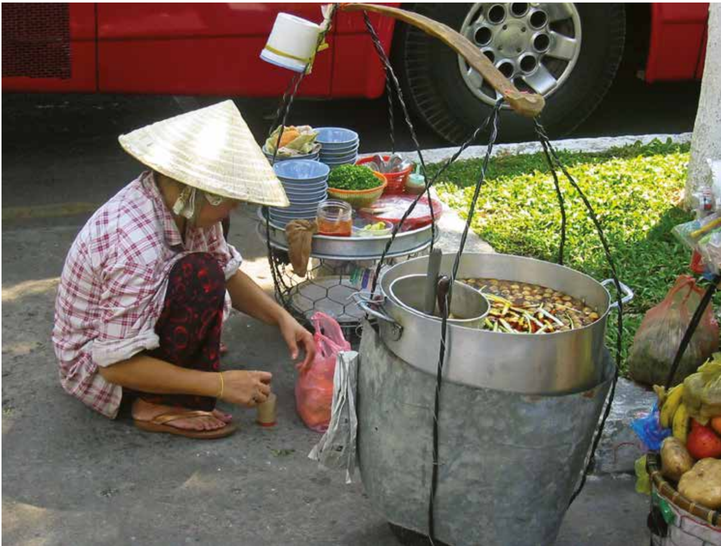
Street vendor in Ho Chi Minh City, Vietnam.