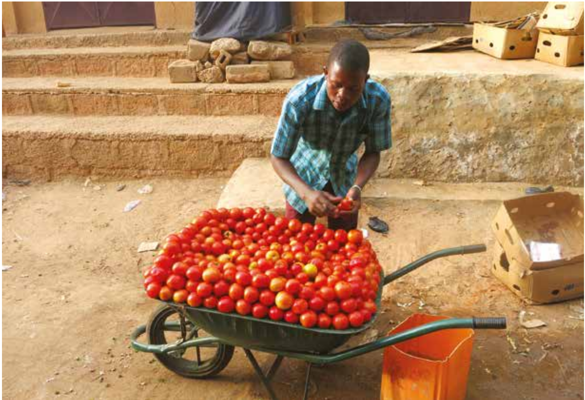
Informal tomato vendor in Niger. Benjamin Michelin.