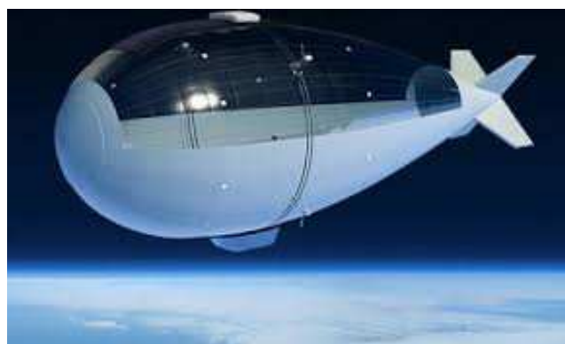
Fig. 1. Stratobus vehicle (concept by Thales). The solar power is collected through the transparent portion of the envelope and reflected toward the lower face of double sided photovoltaic cells, complementing the flux collected directly on their upper face.

The Stratobus platform (Fig. 1) was designed to remain geostationary in the lower stratosphere. At an altitude of 20 km, jet streams are reduced and the engine power needed to counter the wind is compatible with the flux of solar energy collected on board, leaving enough extra power to recharge batteries to keep running at night, and to supply the payload. Such a balance being achieved, this drone remains above a target site 24/7.