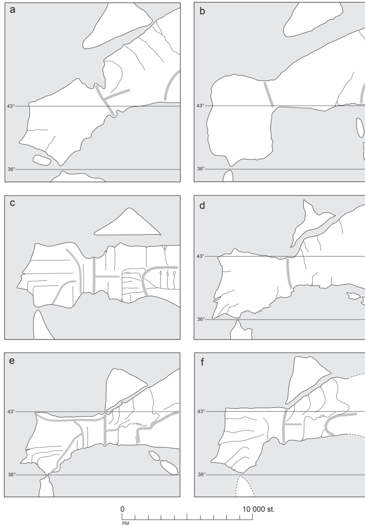
Figure 15.1 Different reconstructions of the map of Western Europe according to Strabo. a: Miller 1898; b: Aujac 1969; c: Lasserre 1966; d: Gosselin 1790; e: Müller 1857; f: Berthelot 1933

contrariwise to the opinion of certain authors, whom he does not name (2.4.3). But a little further on, Strabo writes exactly the opposite, this time based on evidence from navigators: “the longest passage from Celtica to Libya, namely, that from the Galatic Gulf, is 5,000 stadia, and this is also the greatest width of the sea”. There cannot thus be more than 2,500 stadia between Massilia and the Rhodes parallel; which leads to Strabo’s new conclusion: Massilia is not on the parallel of Byzantium (2.5.8, confirmed in 2.5.19).