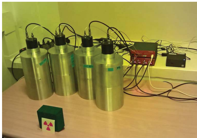
Figure 3. Fully operational detectors and data readout for photofission system. Detectors were designed at NCBJ, the electronics were produced by CAEN.