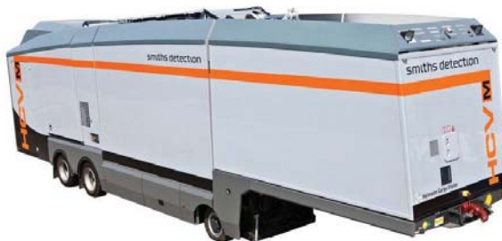
Figure 1. The HCVM-T towable X-ray system upgraded in C-BORD project.

organic materials as well as global image quality. Moreover, the modernization will also cover the stationary solution, working currently at Rotterdam test site.