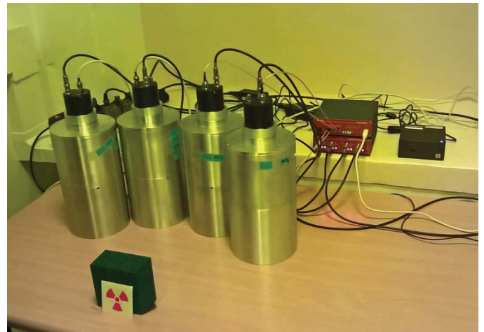
Figure 3. Fully operational detectors and data readout for photofission system. Detectors were designed at NCBJ, the electronics were produced by CAEN.