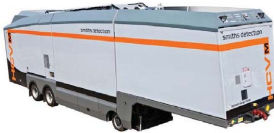
Figure 1. The HCVM-T towable X-ray system upgraded in C-BORD project.

organic materials as well as global image quality. Moreover, the modernization will also cover the stationary solution, working currently at Rotterdam test site.