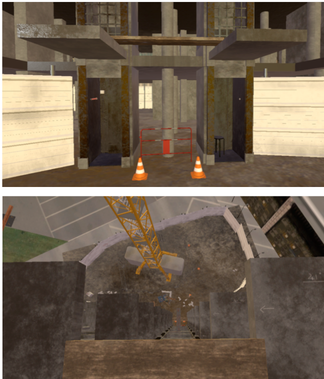
Figure 1: Screenshots of the virtual environment of ReViSTIM project.