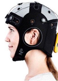
Figure 2: Example of a tDCS cap.