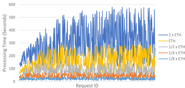
Figure 3. Processing times of Requests to RBGC.