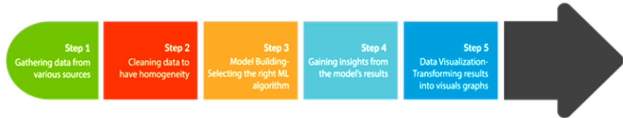
Fig. 3. Machine Learning Workflow.