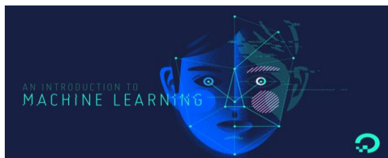
Fig. 1. Machine learning concept.

Machine learning (ML) is a field of study that may allude to computers learning from past understanding (past information) to enhance future execution. The main focus of this field is the ability of machines to use programmed learning techniques. Learning alludes to understanding or studying changes with reference to past encounters.