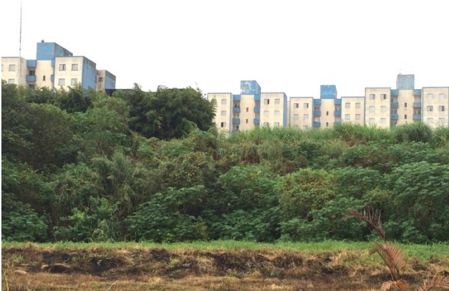
Figure 6. We have seen the above condo that feels like a fort-castle built on a hill. It appears as a fortress, banished by a vast area of impassable vegetation... and block the horizon. The condo is isolated from the other inhabited neighborhood, like a quarantine.

a noisy and magical contamination, acting as a reminder of the original catastrophic noise, became possible – a fear that very quickly gave way to the prospect of a liberating and productive gesture. Even though there were not many participants, the production of a sound space through a scream and weakly projected onto the walls because of the distance represented, for a brief moment, the intense desire for a possible form of becoming.