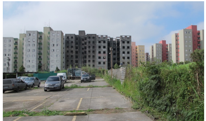
Figure 2. Barão de Mauá residential condominium. Halted constructions next to the inhabited buildings.

smoke smells can easily be transposed into site-specific miasmas. In the same way, all the researchers notice the "weight of the sky" that the birds cannot make lighter. Perceptible thanks to their singing, the oral investigation reveals, however, that the birds feed on fruits that have almost certainly been contaminated. The sky has many aircraft passing through at low altitude, which contributes to the shared sense of an atmosphere of heaviness. Finally, beyond the details that provide consensus for a final report, we must note a fine sharing of all the rhythms of discovery and crystallization of theoretical affect.