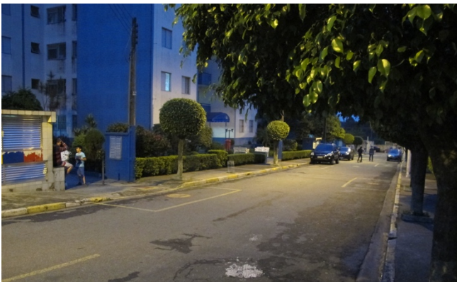
Figure 4. Barão de Mauá at dusk.

On the auditory level, many people remember the explosion of 2000, so when they hear a sudden noise, an impact sound, they cannot help but think of the possibility of another explosion. A state of auditory vigilance persists as if the inhabitants remain on the lookout for an accident to come. Moreover, there is an enigmatic silence all over the neighborhood. In particular, the sound of cars being parked – and sometimes, of Geoklock's work – is very noticeable. Following the investigation and attentive listening, it is necessary to note the little sound presence of the residents, the noise of (human) life. Everything happens as if the sound space of the condominium was inconsistent, punctuated from the outside (there is a very lively district just opposite) by the diffuse sounds of the city in the distance (noise of the main road and the petrochemical complex) and the very low sound ceiling, as if the sounds from the inside could not really be heard or could not create their own atmosphere.