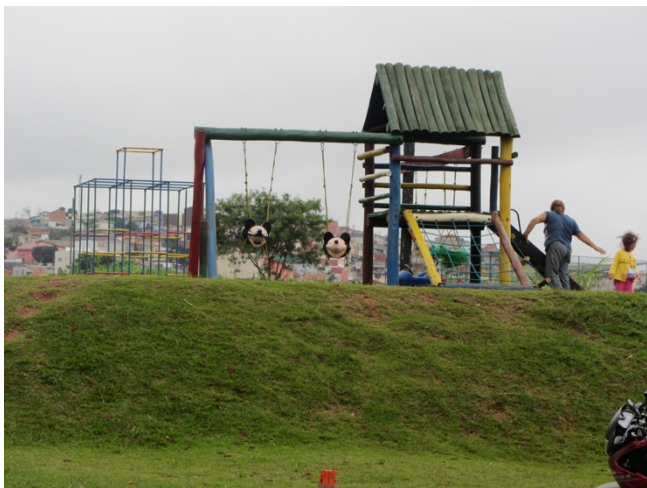
Figure 5. An equipment that we learn to decipher...

Although the past, the present and the future are now shared among the inhabitants of the neighborhood, life is nonetheless still there. A solidarity, a mixture of attachment to a collective home, public actions and expertise, has developed between the inhabitants. Although the condominium has no public space, no collective space, there are places to meet and talk.