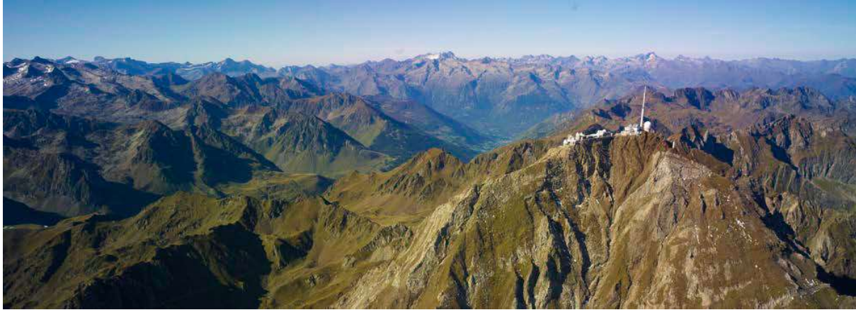
Fig.: Pic-du-Midi Observatory and Scientific Station: in regular use from 1883 1