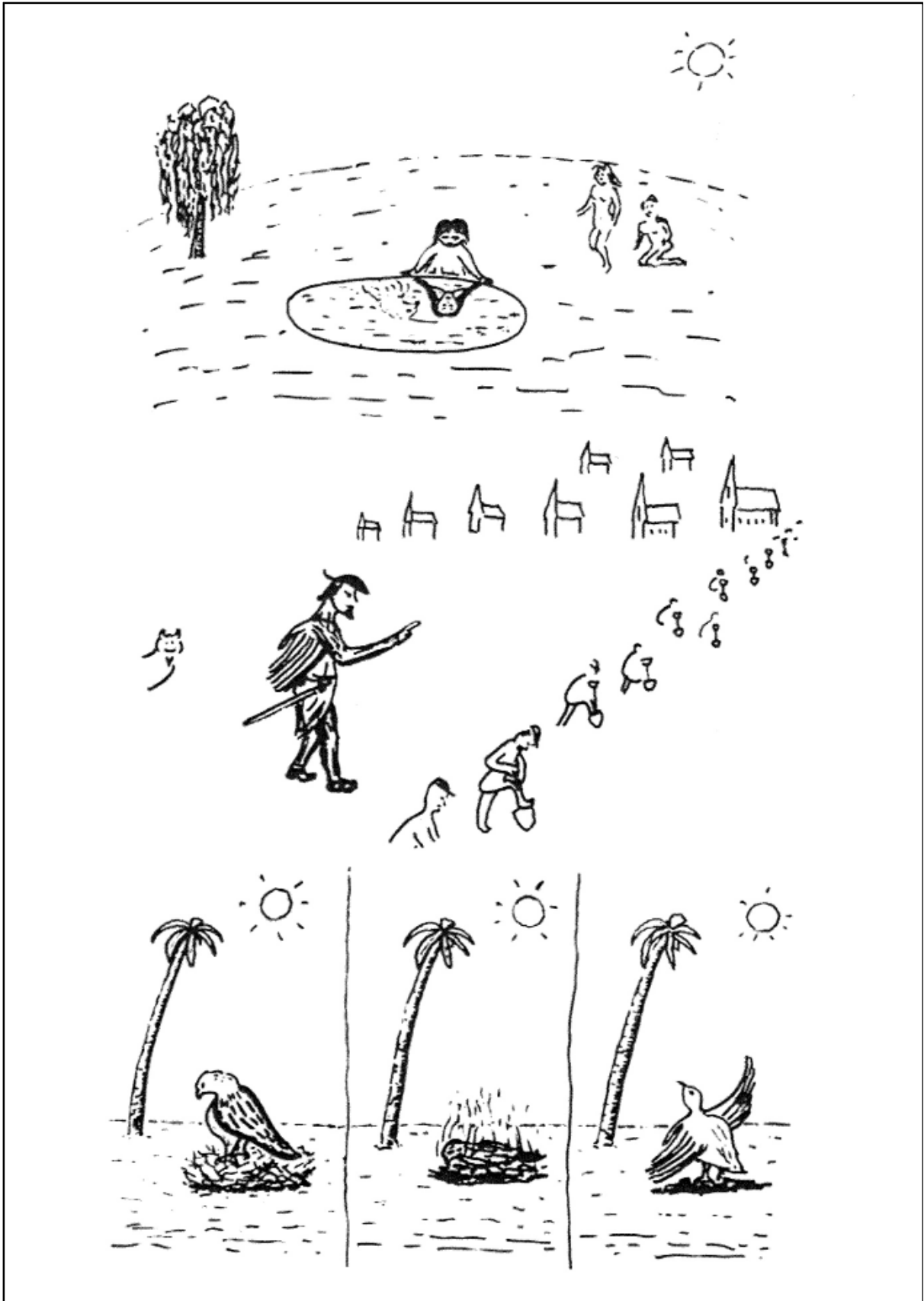
Fig. 6. 'Phoenix–Faust–Narcissus: cyclical refrain in the Western story' (UCD, Archives Anne Buttimer, Various Folders)