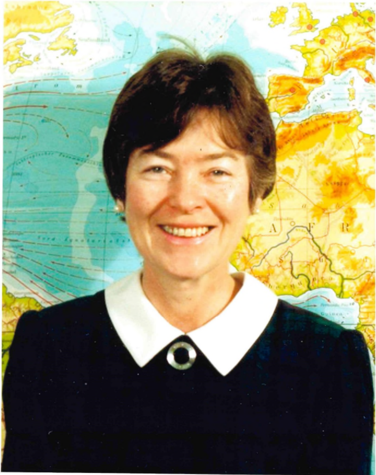
Fig. 1 Anne Buttimer