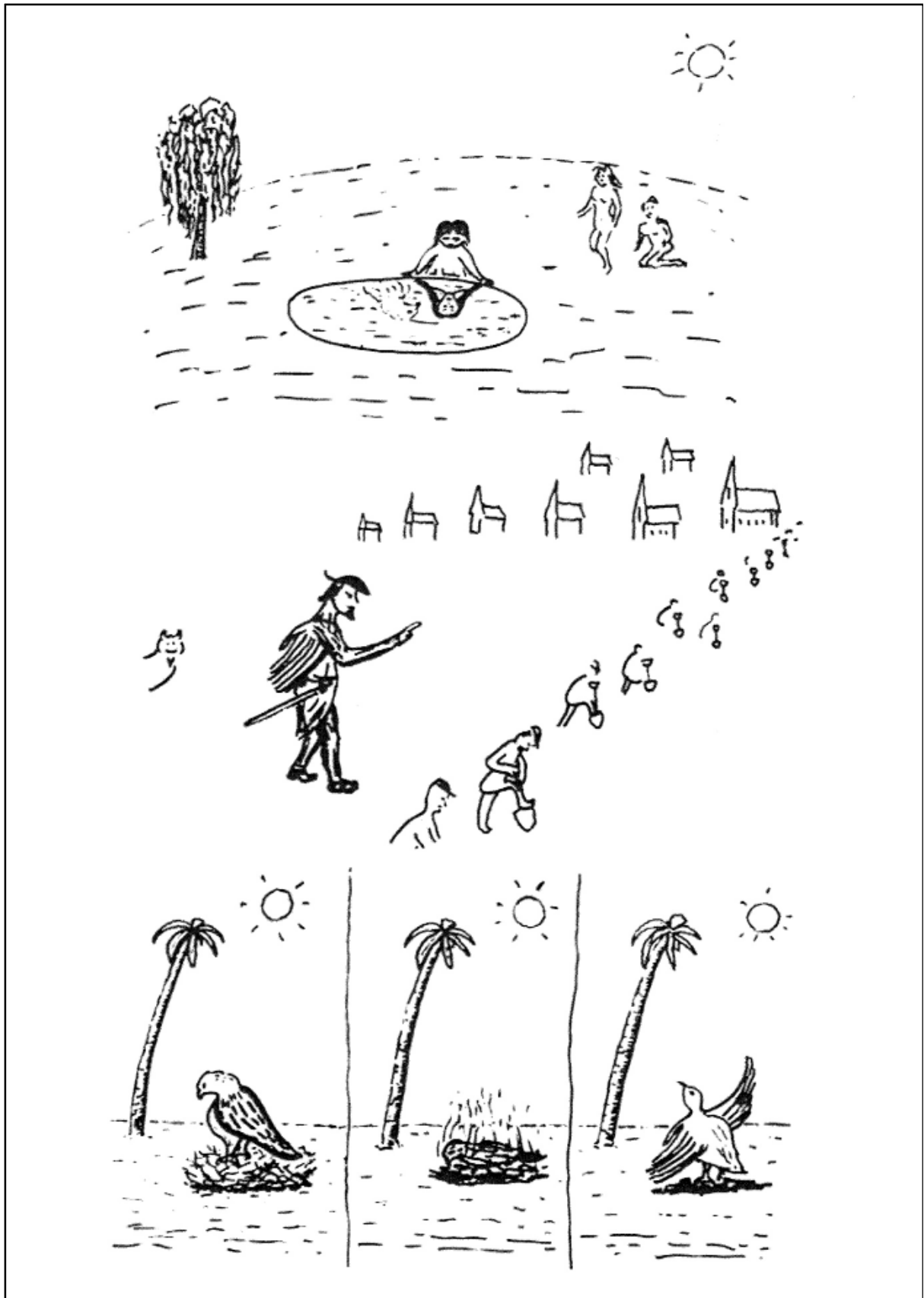
Fig. 6. 'Phoenix–Faust–Narcissus: cyclical refrain in the Western story'