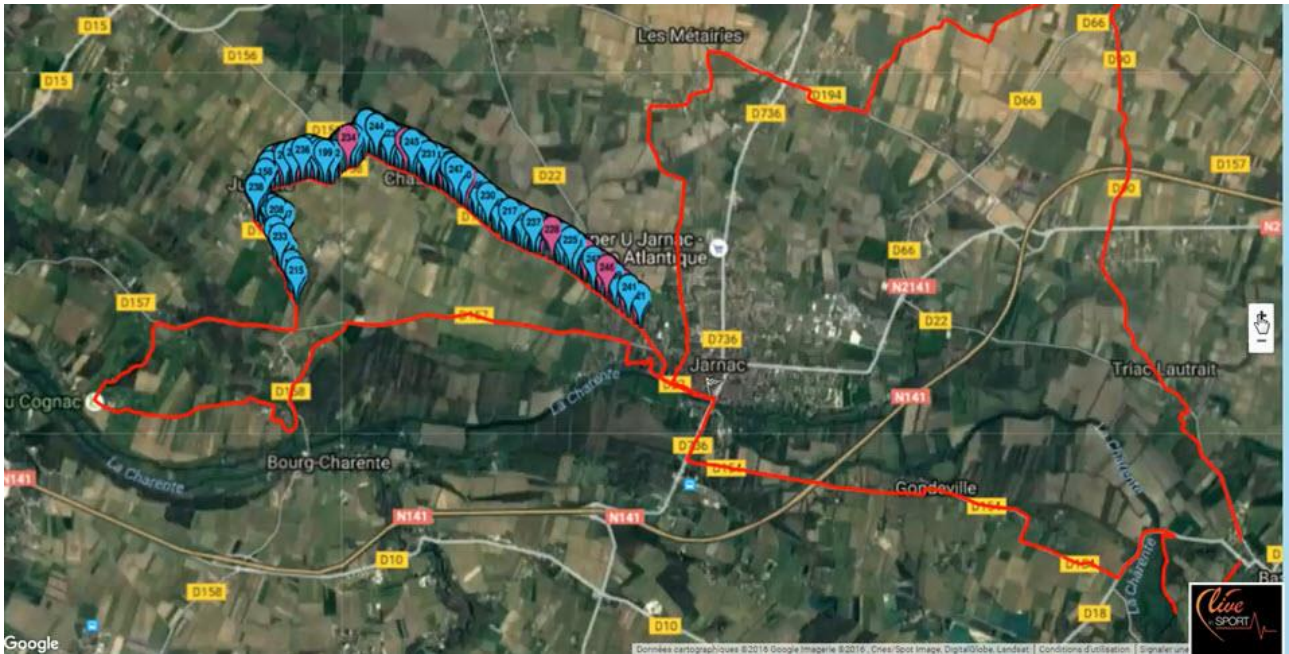
Figure 1 Google Map 2D live view (Marathon du Cognac, Sources : Google, LiveInSport)