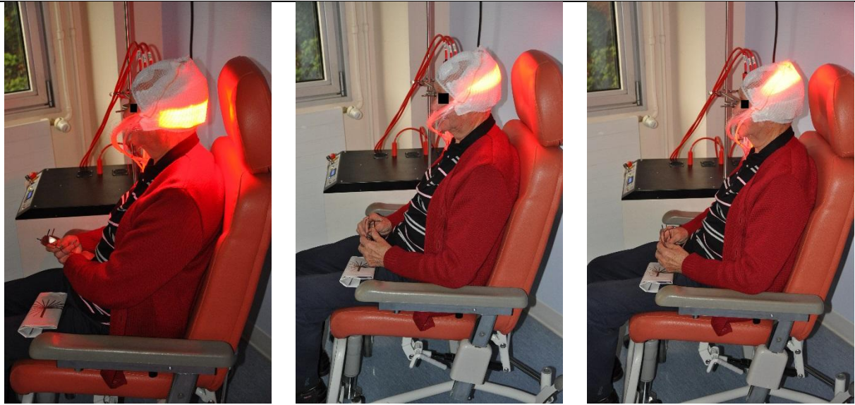
Figure 1: The three flexible, light-emitting optical fibre-based fabrics used for FLEXI-PDT sequentially emit 635 nm red light for 1 minute, resulting in fractionated irradiation (1 minute of light, 2 minutes of darkness).