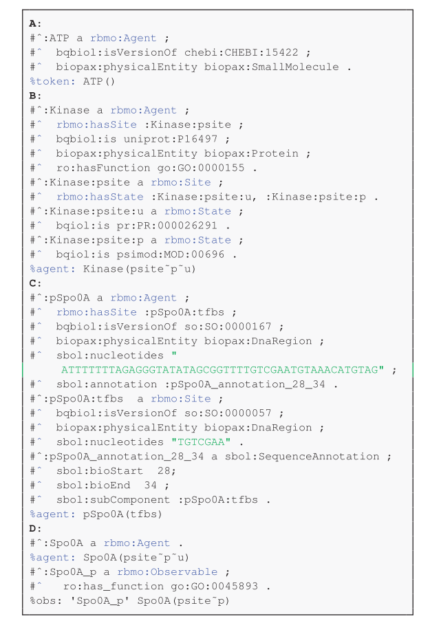
Fig. 3. Examples of agent annotations for (A) an ATP token agent. (B) A kinase agent with phosphorylated and unphosphorylated site. (C) A promoter agent with a TF binding site. (D) An agent and an associated observable for the phosphorylated Spo0A protein, which can act as a TF