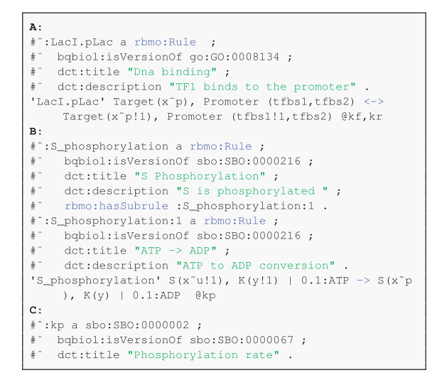
Fig. 4. Annotating rules and variables. (A) TF DNA binding rule. (B) Phosphorylation rule with a subrule for the ATP to ADP conversion. (C) Annotation of a phosphorylation rate variable

see that the rule has a title, 'Cooperative unbinding', which clearly could not have been derived from the rule itself. This represents a good example of merging the metadata supplied by the model author with an RDF representation of the rule.