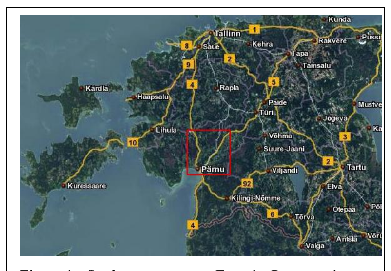
Figure 1 - Study area: western Estonia, Pärnu region

Presented work illustrates application of the GIS based processing of various geographic data: satellite images and CORINE (Coordination of Information on the Environment) layers at the lessons of geography in the high schools and universities. The research illustrates GIS application for understanding, visualizing and modeling landscapes of the Earth. Practically, the work aims to demonstrate students, how mapping land cover types can be done using GIS and combination of vector and raster geospatial data.