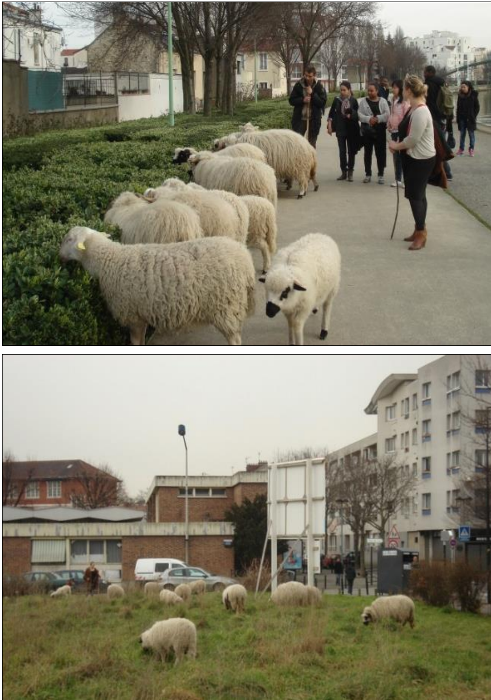
Figure 3: Pictures of sheep herding (top) and rangelands on vacant lot (bottom) in Saint-Denis, north of Paris.

These nomadic off- or on-the-ground UA initiatives comprise only a small part of the urban agriculture initiatives we observed. Nevertheless, a greater number of gardens – half of the collective gardens we visited – have only