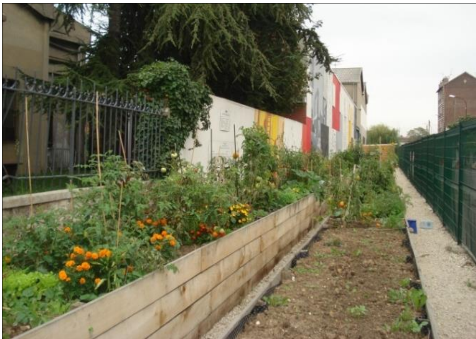
Figure 4: Cristino Garcia collective garden in Saint-Denis, north of Paris. Photo by the authors, 2013.

temporary access to their lots and, as a consequence, many have adopted temporary structures to hold soil, such as raised beds or trays (see Figure 4), without making them an explicit objective of the project (which is why we do not consider them “nomadic”). Most garden participants explained that the main reason they adopted raised beds and trays is because they are in fact a relatively cheap way of resolving the issue of possible or existing soil contamination, which can be used by city health departments as a justification to prohibit food production. In 2014, twenty-three of the forty-four institutionalized gardens studied were entirely cultivated with raised beds or trays, and nine partly so. All were used for vegetable production. This proportion has since increased; of the six gardened vacant lots that have been removed, which were among the oldest shared gardens, five were cultivated directly on the ground.