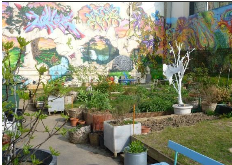
Figure 2: Ecobox, a garden on pallets in the 18 th arrondissement, Paris. Photos by the authors, March 2010 and April 2012.