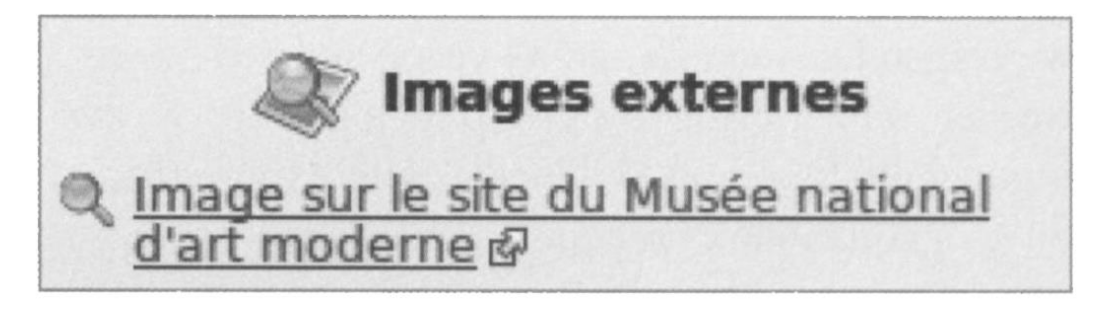
Figure 1 - Images from external site: Image from the site of Musée nationale de l'art moderne - Wikipedia message that appears for images without copyright permission

Beyond these principles, each linguistic community (and there are more than 280 of them) defines its own independent internal principles of organization (the types of article which are acceptable, rules for the election of the administrators<sup>10</sup>...).