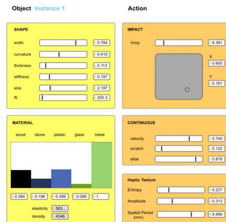
Figure 2: Interface of the interactive sound synthesizer

The haptic surface device Fig.1 is based on ultrasonic friction modulation. A glass plate is made to vibrate at a resonant mode and the vibrations cause the finger to slightly levitate from the plate. The near-field acoustic levitation of the finger dramatically reduces the friction between the finger and the screen [9]. Modulating the amplitude of the ultrasonic vibration allows for a controlled modulation of the friction force applied to the finger. Patterning friction as a function of position and velocity of the finger can thereby create the illusion of touching shapes and textures [1].