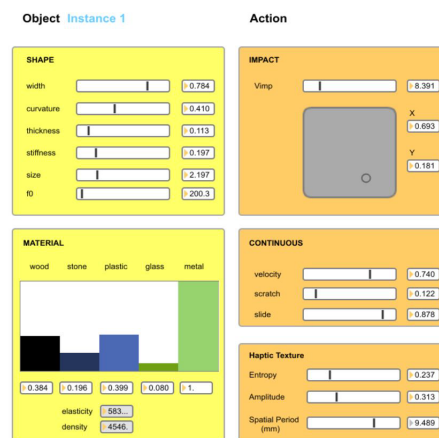
Figure 2: Interface of the interactive sound synthesizer

The haptic surface device Fig.1 is based on ultrasonic friction modulation. A glass plate is made to vibrate at a resonant mode and the vibrations cause the finger to slightly levitate from the plate. The near-field acoustic levitation of the finger dramatically reduces the friction between the finger and the screen [9]. Modulating the amplitude of the ultrasonic vibration allows for a controlled modulation of the friction force applied to the finger. Patterning friction as a function of position and velocity of the finger can thereby create the illusion of touching shapes and textures [1].