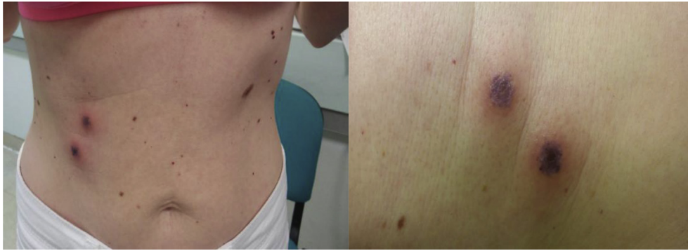
Fig. 1. The two abdominal inoculation eschars.

inoculation eschar and lymphadenitis, it was named lymphangitis-associated Rickettsiosis (LAR), though this clinical feature was inconsistently described. Typical clinical signs include fever (100%), headache (86%), myalgia (90%), cutaneous rash (77%), enlarged lymph nodes (71%) and/or lymphangitis (43%), and single or multiple inoculation eschars (92%) 1 . A history of tick bite is reported in less than 50% of cases. Most of the cases occur in spring and summer, probably due to the activity of the tick vectors. No fatal case has been observed, but complications such as retinal vasculitis, lethargy with hyponatremia, septic shock, myopericarditis, and acute renal failure, have been described.