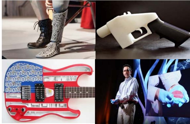
Figure 1 – Use of 3D printing in different aspects (from prostheses and firearms, to consumer goods and in medicine).

Paper is organized as follows - 3D printing is introduced and characteristics defined in the next section. Problematic and socio-environmental implications linked with the use of 3D printing are presented in section 3. Concluding thoughts and limitations are presented in the final section of the paper.