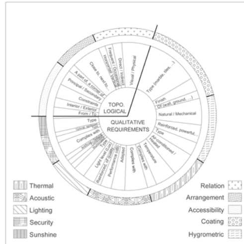
Figure 2 Topological and qualitative requirements summarised diagram

In the Design Model, architectural <Space> has three types of data classified as follows:<General> data, which indicates general properties of space (e.g. ID, GUID, name, etc.).<Geometrical> data, which groups geometrical properties of space (e.g. length, width, ceiling height, position, etc.) and <Quantity>