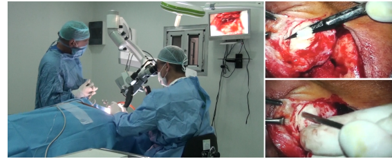
Figure 1: Ear surgery: Surgeon performing the surgery (left), images visualized through microscope (right).

The basic motor task chosen for our simulator is a pick-and-place task, and is designed so as the user must use one tool in each hand to manipulate small objects from one position to another, by