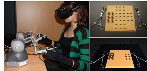
Figure 2: Simulator implementation

switching them from one tool to the other. It is inspired from the peg and transfer task used in VR simulators to train surgeons to master hand-eye coordination and bi-manual dexterity in laparoscopic surgery [9]. The difference between the chosen task and the original laparoscopic training task is that users see the objects in a 3D view and in the same direction where they manipulate them. This is similar to what can be experienced in ear surgery under a microscope, for instance (see Figure 1).