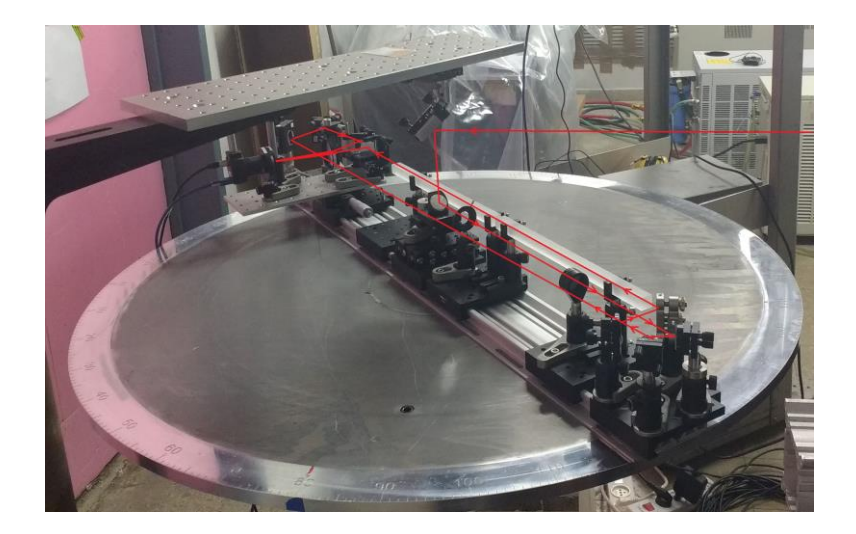
Fig. (1) The Goniometer & Optical Bench. The red line represents the trajectory of the laser pulse with arrows indicating the direction of propagation of the pulse.