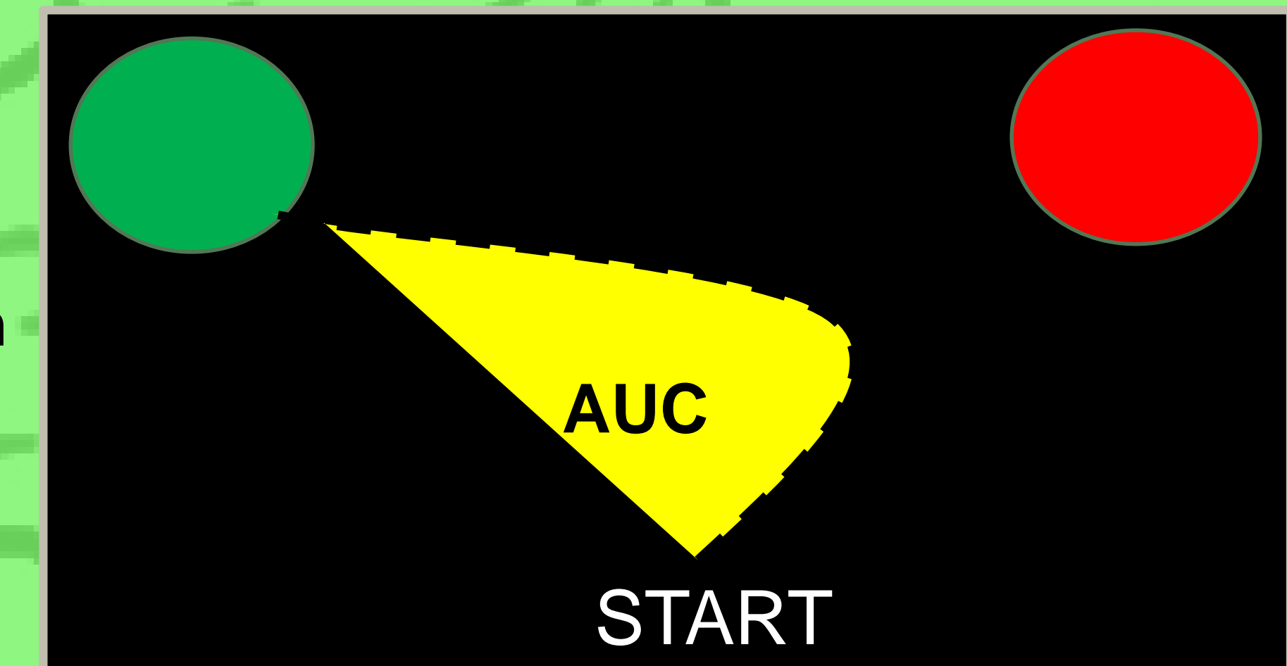
Figure 2. Sample illustration of the AUC

3) Self report measure (Exp) . 2x2 scale of achievement goals Elliot & Murayama (2008)