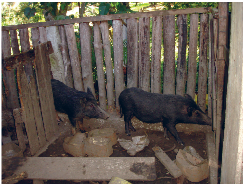
Photo: Backyard subsistence pig farming is probably a major source of leptospirosis in most of the Pacific Island Countries and Territories, where the highest burden is reported from around the globe (from C. Goarant, used with permission)

The research community as well as funding agencies tend to show favouritism for “hot topics” instead of allocating resources based on health needs. Leptospirosis is not regarded as an exciting field and leptospirosis research consequently suffers a major lack of resources. Relying on the global burden of diseases to allocate research funding could avoid the vicious circle of neglect in which leptospirosis currently sits.