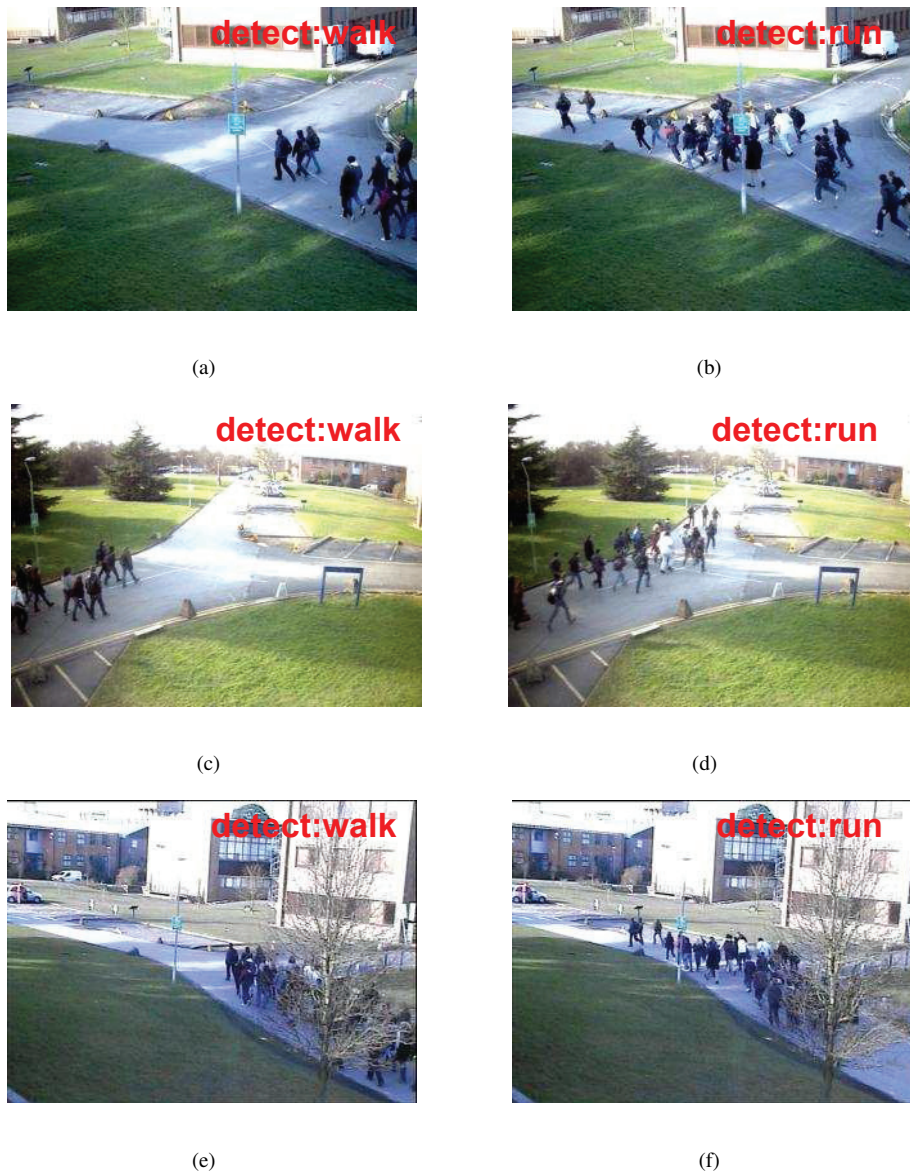
Fig. 6: Detection results of the normal and abnormal scenes of Time 14-16 captured by the distributed camera network, the individuals are moving from right to left. (a)(c)(e): The detection result of one normal frame, the individuals are walking in one direction. (b)(d)(f): The detection result of one abnormal frame, the individuals are running in one direction.