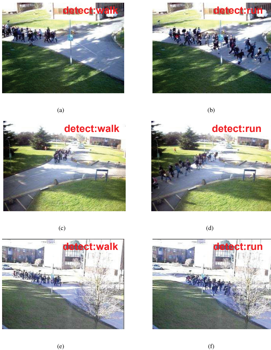
Fig. 7: Detection results of the normal and abnormal scenes of Time 14-16 captured by the distributed camera network, the individuals are moving from left to right. (a)(c)(e): The detection result of one normal frame, the individuals are walking in one direction. (b)(d)(f): The detection result of one abnormal frame, the individuals are running in one direction.

Conference on Computer Vision (ICCV) , 2011, pp. 2198–2205.