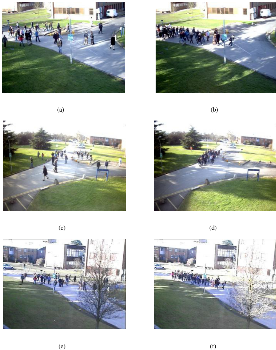
Fig. 2: Examples of the normal and abnormal scenes captured by distributed cameras of PETS dataset. (a)(c)(e): The people are walking in different directions, the normal scenes of Time 14-55 sequence; (b)(d)(f): The people are walking in the same direction, the abnormal scenes of Time 14-17 sequence; (a)(b): scenes captured by camera 1; (c)(d): scenes captured by camera 2; (e)(f): scenes captured by camera 3.

a bag of topics drawn from a fixed set of proportions [11]. In [12], the covariance matrix descriptor fusing the optical flow to encode moving information of a frame was presented. These work focused on the single view scene video analyzing, the feature abstraction method or the event models were heavily researched in the abnormal detection problem. Moreover, the abnormal event detection problems in distributed camera networks have a considerable room.