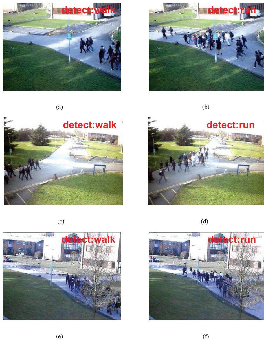
Fig. 6: Detection results of the normal and abnormal scenes of Time 14-16 captured by the distributed camera network, the individuals are moving from right to left. (a)(c)(e): The detection result of one normal frame, the individuals are walking in one direction. (b)(d)(f): The detection result of one abnormal frame, the individuals are running in one direction.