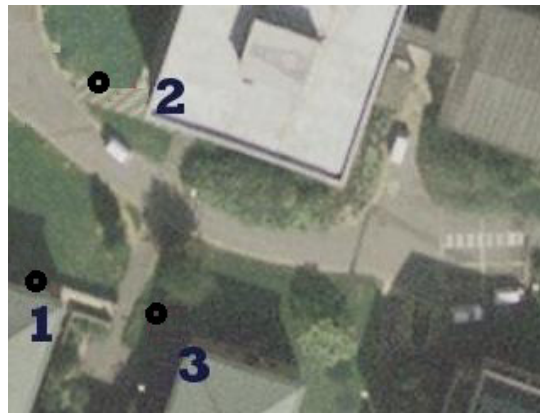
Fig. 1: The plan of the multi-camera localizations in the PETS dataset. Three cameras are set in the campus.

directions, implying that people are attracted by some particular events, consequently, these scenes are considered as abnormal. The scenes are captured by different cameras. Fig. 2(a)(b) are captured by camera 1 which is set at the side of the road, the movement of the people are well captured. Figs. 2(c)(d) are captured by camera 2 which faces the movement direction of the people, and there is occlusion of the individuals in this view. Figs. 2(e)(f) are captured by camera 3 which is also set at the side of the road, with larger distance. The purpose of the distributed camera surveillance is to detect abnormal events by benefitting the multi-view video sequences. Distributed camera networks are now widely used for surveillance application.