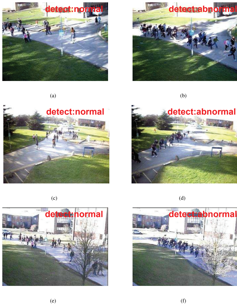
Fig. 4: Detection results of the normal and abnormal scenes of Time 14-17 captured by distributed camera network. (a)(c)(e): The detection result of one normal frame. (b)(d)(f): The detection result of one abnormal frame.

View 2 has the lowest area under the ROC (receiver operating characteristic curve), since as previously mentioned, the camera 2 faces the movement direction of the crowd, the occlusion influences the computation of the optical flow. Thus the HOFO feature based on the optical flow cannot represent the accurate movement information. The results show that the abnormal detection algorithm of HOFO feature can obtain satisfactory detection results. Moreover, the multi-kernel strategy can generally improve the performance. The parameters of the multi-kernel influence the performance. Thus, the optimal parameters should be sought.