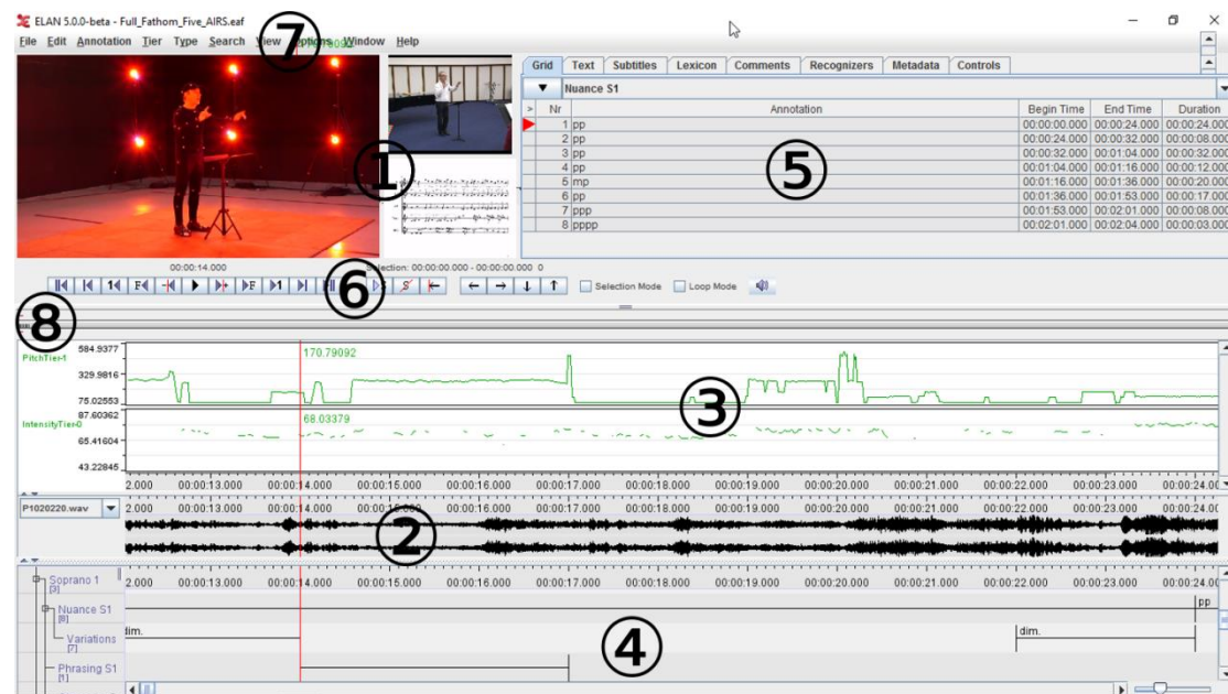
Figure 16.1: The ELAN interface.