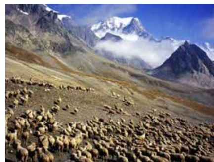
Figure 4 Sheep herds in Kyrgyzstan mountains.

They include many endemic species, typical for desert arid areas. For humid regions of Tian Shan typical are arctic and boreal species that area characteristic for humid ecosystems (meadows) and tundras.