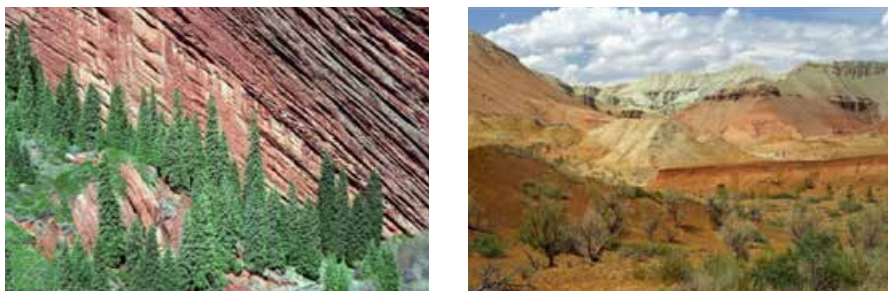
Figure 3 Landscapes of Altyn-Emel National Natural Park (Kazakhstan).

Alatau and Zailiysky Alatau. They form the geomorphic basis of the northern region. Outer important chains of the northern Tien Shan, isolated apart from the main massif, are Ketmen Range and a Kyrgys Range (Svarichevskaya, 1965). Central (or Inner) Tian Shan includes Terskey Alatau Range with heights raising up to 5300 m, which forms a natural arch surrounding Issyk Kul lake (Fig.2). To the south of Issyk Kul Lake, the geomorphic structure is presented by the wide river valleys, plateaus, and peripheral mountain ranges (Zlotin, 1978). This region is formed by complex of alternating short mountain ranges and valleys extending westwards. The most important ranges of the Central Tian Shan are Borkoldoy, Dzhetyim, At-Bashy, and the Kakshaal Ranges; the highest point is Dankova Peak reaching 5,982 m.