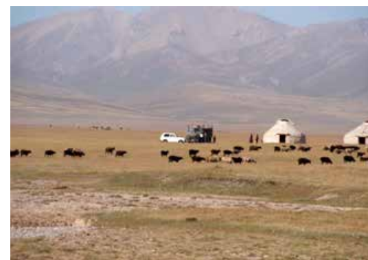
Figure 6 Kyrgyzstan. Son-Kuul Pasture.

The effective solving of the existing environmental problems in mountainous regions of Tian Shan has a common basis in all its sub-regions. For example, the use of pastures in the border areas and grazing leading to land degradation is the same for Tajikistan, Kyrgyzstan and Uzbekistan. Not sustainable way of land use and inadequate agriculture management in the fields of Tian Shan valleys are another example of a common environmental problem for all Central Asian republics. The problem of deforestation in Tajikistan and Kyrgyzstan is one of the major causes of soil erosion on the mountain slopes, which not only leads to desertification of mountain areas, but also causes silting of debris from the rivers and lakes. Other anthropogenic effects include, for instance, mining industry. The mining industrial sector of the republics of Tajikistan, Kyrgyzstan and Uzbekistan worked in close collaboration during the Soviet era. Therefore, many ecological problems became deeply interconnected and triggered related problems. In addition, many mining and processing enterprises are located in famous Fergana Valley, which is a part of all the three Central Asian republics of Tian Shan basin. Regardless of the exact location, the business activities in Fergana valley are causing water and air pollution, as well as