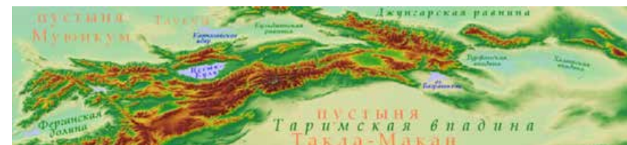
Figure 1 Tian Shan mountain range

Tian Shan, or the 'Celestial Mountains', is one of the largest world high mountain systems, covering 800 000 km 2 . Region of Tian Shan has unique geopolitical location in Central Asia ( Fig.1 ): it crosses five densely populated countries: China, Kazakhstan, Kyrgyzstan, Uzbekistan, and Tajikistan.