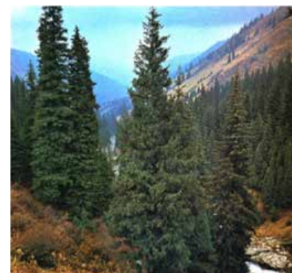
Figure 5 Schrenk forests in Tian Shan.

The endemic flora of National Parks in Tian Shan region counts to thousands of rare and unique species typical to this region and not found elsewhere. The climatic settings of Tian Shan in general are typical continental. However, there are local climatic differences formed in various geographic conditions: the most extremely cold and dry climate is in inner parts of mountains on the high plateaus, while northern and western slopes of Tien-Shan are characterised by more temperate climate. Thus, the mean summer temperature is 3.7°C at the altitude of the Equilibrium Line Altitude (ELA) in the western regions and -8.1°C in the east; the annual precipitation is 1500-2000 mm in the west and 200-400 mm in the east, respectively (Bondarev et al., 1997). The northern slopes of Tian Shan, such as Kyrgyz Alatau and Zailiysky Alatau, have major influence of cyclonic activity. Precipitation in Tian