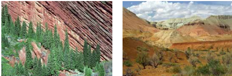
Figure 3 Landscapes of Altyn-Emel National Natural Park (Kazakhstan).

Alatau and Zailiysky Alatau. They form the geomorphic basis of the northern region. Outer important chains of the northern Tien Shan, isolated apart from the main massif, are Ketmen Range and a Kyrgys Range (Svarichevskaya, 1965). Central (or Inner) Tian Shan includes Terskey Alatau Range with heights raising up to 5300 m, which forms a natural arch surrounding Issyk Kul lake (Fig.2). To the south of Issyk Kul Lake, the geomorphic structure is presented by the wide river valleys, plateaus, and peripheral mountain ranges (Zlotin, 1978). This region is formed by complex of alternating short mountain ranges and valleys extending westwards. The most important ranges of the Central Tian Shan are Borkoldoy, Dzhetyim, At-Bashy, and the Kakshaal Ranges; the highest point is Dankova Peak reaching 5,982 m.