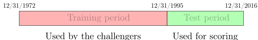
FIGURE 1. Training and test samples from different periods of observation.

At the Extreme Value Analysis conference in Delft in June 2017 a challenge for predicting spatio-temporal extremes was proposed. The aim of the challenge was to estimate high quantiles of daily rainfall and to extrapolate them in time and space. Eight teams competed in the challenge. A data set from the training period was given to each team. Based on the data from the training period each team predicted the corresponding high quantiles for the adjacent test period. The goal was to score those teams that achieved the best predictive power.