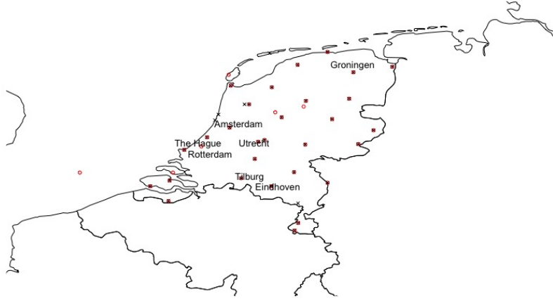
FIGURE 4. Locations of the 40 stations used in the challenge. The red circles show the 35 stations active during the training period, the dark crosses represent the 34 stations active during the test period.