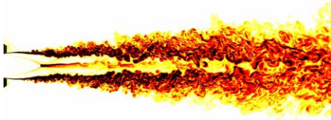
Fig. 1: instantaneous vorticity field