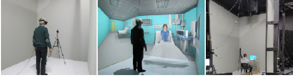
Figure 1: Participants interacting with the virtual patient with different virtual environment displays (from left to right): virtual reality headset, virtual reality room, and PC.

(floor). A cluster of graphics machine makes it possible to deliver stereoscopic, wide-field, real-time rendering of 3D environments, including spatial sound. This offers an optimal sensorial immersion of the user. The environment has been designed to simulate a real recovery room where the breaking bad news are generally performed. The virtual agent based on the VIB platform [20] has been integrated in by means of the Unity player.