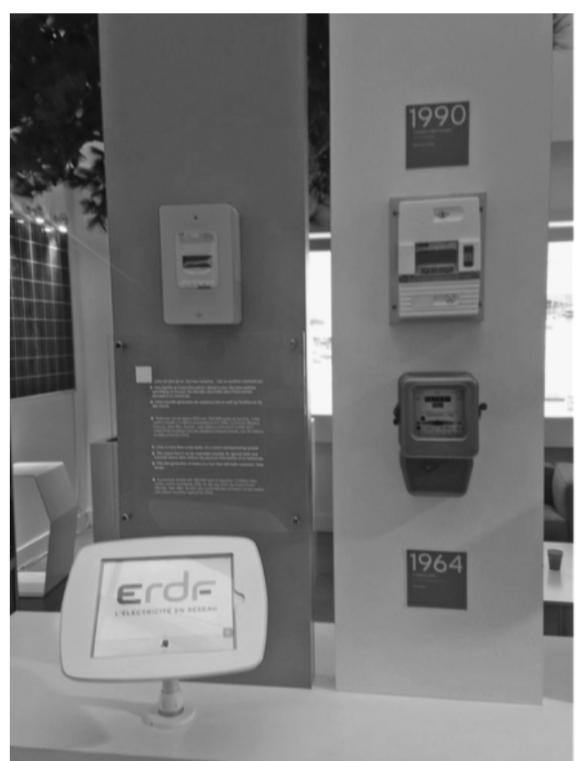
FIGURE 13.3 Electronic meters, introduced into homes in 1990 (right, at the top). We can also see one smart meter Linky (left). From 'The saga of the meter', electric meters in the exhibition showroom of the French electric distributor Enedis in Paris. Personal photograph.

results of customers' actions as revealed by the energy they consume. The second part focuses on professionals and experts who are in direct contact with customers. These experts construct and work with a very different figure of the customer: this being one who needs disciplining, who is potentially 'dishonest' or 'not interested' and who has to be made to pay their bill. In bringing these experiences together, I conclude with a discussion of the different routes through which definitions and uses of the smart meter have been stabilised.