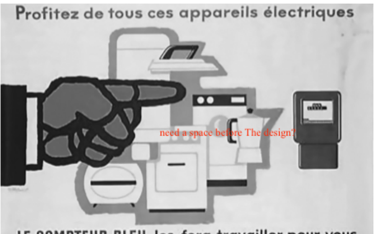
LE COMPTEUR BLEU les fera travailler pour vous

FIGURE 13.2 'Enjoy all the electrical appliances. The blue meter will make them work for you'. Commercial advertising from the French energy supplier EDF. Illustration by Bernard Villemot, circa 1964, © Bibliothèque Forney/Roger-Viollet.