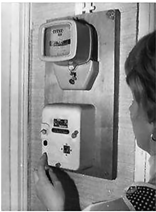
FIGURE 13.1 The French electromechanical meter, introduced into homes in 1963.