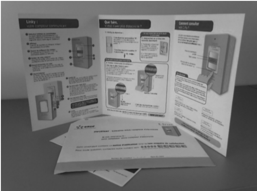
FIGURE 13.4 User manual for the new generation of smart meter ‘Linky’ launched in 2010. Personal Photograph.