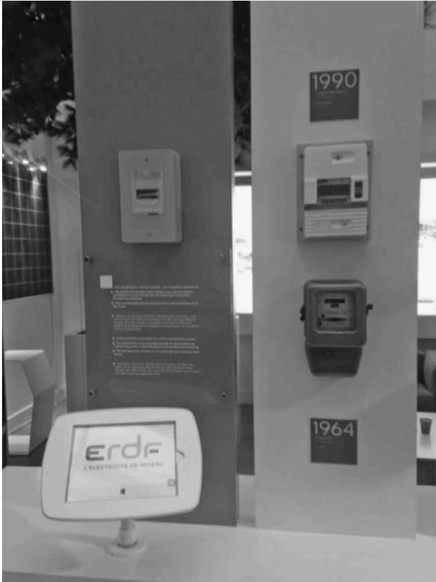
FIGURE 13.3 Electronic meters, introduced into homes in 1990 (right, at the top). We can also see one smart meter Linky (left). From 'The saga of the meter', electric meters in the exhibition showroom of the French electric distributor Enedis in Paris. Personal photograph.

results of customers' actions as revealed by the energy they consume. The second part focuses on professionals and experts who are in direct contact with customers. These experts construct and work with a very different figure of the customer: this being one who needs disciplining, who is potentially 'dishonest' or 'not interested' and who has to be made to pay their bill. In bringing these experiences together, I conclude with a discussion of the different routes through which definitions and uses of the smart meter have been stabilised.