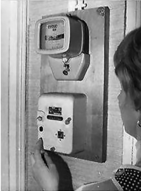
FIGURE 13.1 © AGIP/Bridgeman Images: The French electromechanical meter, introduced into homes in 1963.