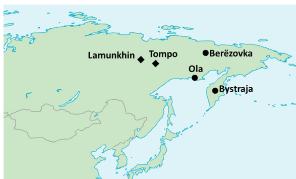
Fig. 1 Map of Even dialects mentioned in this paper; diamonds = western dialect group, circles = eastern dialect group. Created with the WALS Interactive Reference Tool (Bibiko 2005)

the diminutive -kAn as the final element, which can be preceded both by augmentatives and diminutives, and that the resulting forms do not intensify the denotational meaning of the evaluatives, but convey a higher degree of expressivity and imagery of the utterance and an increased dynamicity of the action. Finally, in Sect. 4 the cross-linguistically rare features of the Lamunkhin Even evaluative morphemes are reiterated and discussed; the most striking are the use of the nominal suffixes to mark the referential status of nouns and the structured system of the descriptive evaluative suffixes consisting of sets of diminutive-augmentative pairs. A further rare, though not unique feature, is the transference of the evaluative meaning from adjectives and participles as well as verbs to the head noun/subject referent, respectively.