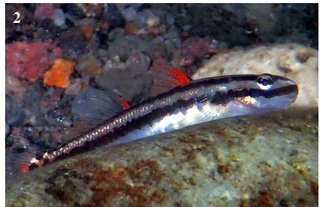
Figure 1. - Stiphodon aureofuscus n. sp., male, Lombok, Indonesia.