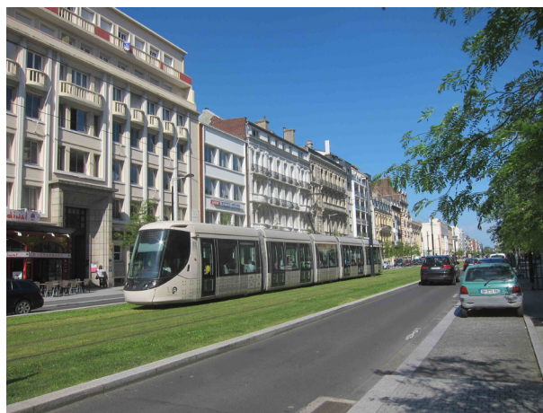
Figure 3. Tramway in le Havre

lines will lead to increased pedestrian flow, increased safety and enhanced social interaction, which in turn will encourage visitors and tourists. Greenery and bike paths parallel to the tramway tracks are supposed to reintroduce nature and healthy lifestyles in the city. In Reims, the reconstruction of the tram network was accompanied by the planting of 1,700 trees, 34,800 bushes and more than 80,000 square meters of lawns alongside the tracks, creating a new green corridor in the city.