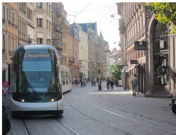
Figure 2. Tramway in the centre of Strasbourg

It is hoped that the “softened” use of public spaces through the implementation of quality landscaping alongside the tramway