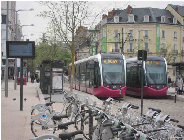
Figure 5. Tramway and bike rental stations in front of the Dijon train station

transportation routes, their frequency of services, and the size of transport fleets. Most bus lines are characterized by a low frequency of services and the use of smaller vehicles, while many bus routes run through suburbs away from the city centre, even bringing passengers to the tramway lines. The choice of a TOD strategy focusing on investment along the tramway lines, which are already designed to serve traffic-generating places such as train stations, shopping areas, hospitals, stadiums and universities, can only increase the share of tramways in public transit ridership. However, this is not the case in the largest cities: their share was insignificant in Lyon, due to the prevalence of the subway (underground subway lines represented 13% of the total network and 48% of trips) and Lille (subway 34% and 62%).