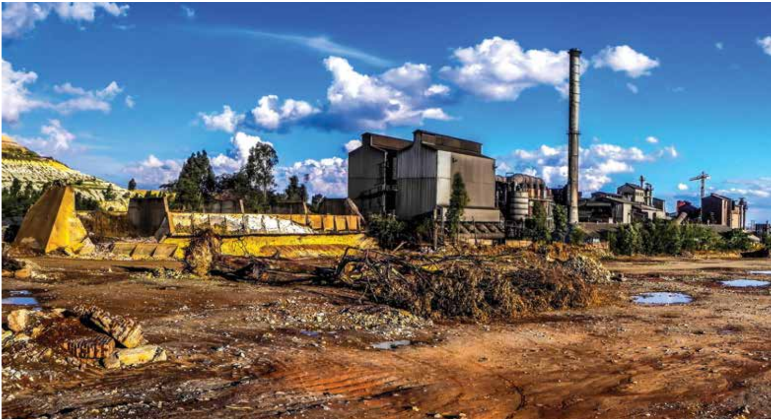
Randfontein Mine, Johannesburg.

Open cast mining causes huge amounts of physical damage to the geology of the land, which has direct implications on the extent to which it can be used after the ore has been extracted. In South Africa, mining companies are required to submit rehabilitation plans before permits are granted, but the guidelines they must follow are often loose and do not take into account how the land was used before mining took place. Generally, mining companies plan on returning land to grassland within three to five years, without recognizing that restoring a sustainable, healthy, mixed farming community can take decades. By pushing for accurate feasibility studies before mining commences, mining companies and communities can get a true sense of the cost of open cast mining and what a just and sustainable approach to the industry might look like.