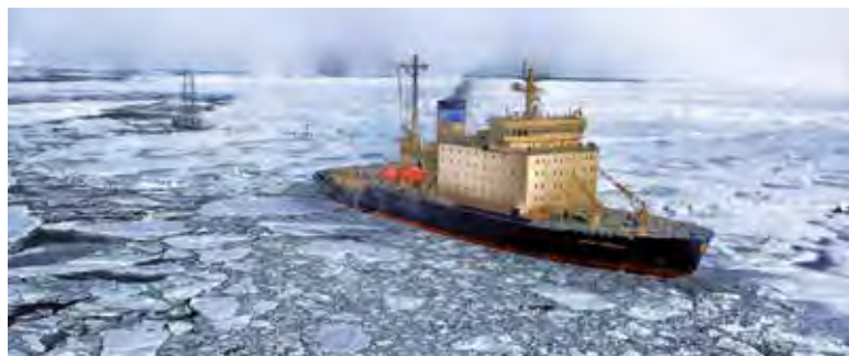
Fig. 1 – Climate change is opening the way for the development of the Arctic, but the environmental and social impact is not neutral. ■

Expansion of human activities in the Arctic is inevitable. Effective governance is complex since the Arctic has many definitions. The ‘race to the cold’ has already started, with strategies switching between building pressure and cooperation. Maritime boundaries still need to be formally agreed upon by all parties involved (Fig. 2). The Commission on the Limits of the Continental Shelf needs to rule on a few applications for extension of continental shelves rich in hydrocarbons and minerals. There is no consensus on the legal status of the Northern Sea Route and Northwest Passage. Iceland has taken advantage of the lack of a regional fisheries management organisation in the Arctic to unilaterally increase its mackerel quotas. Choices for development, coordination and cooperation will have a major impact over the Arctic in the coming years.