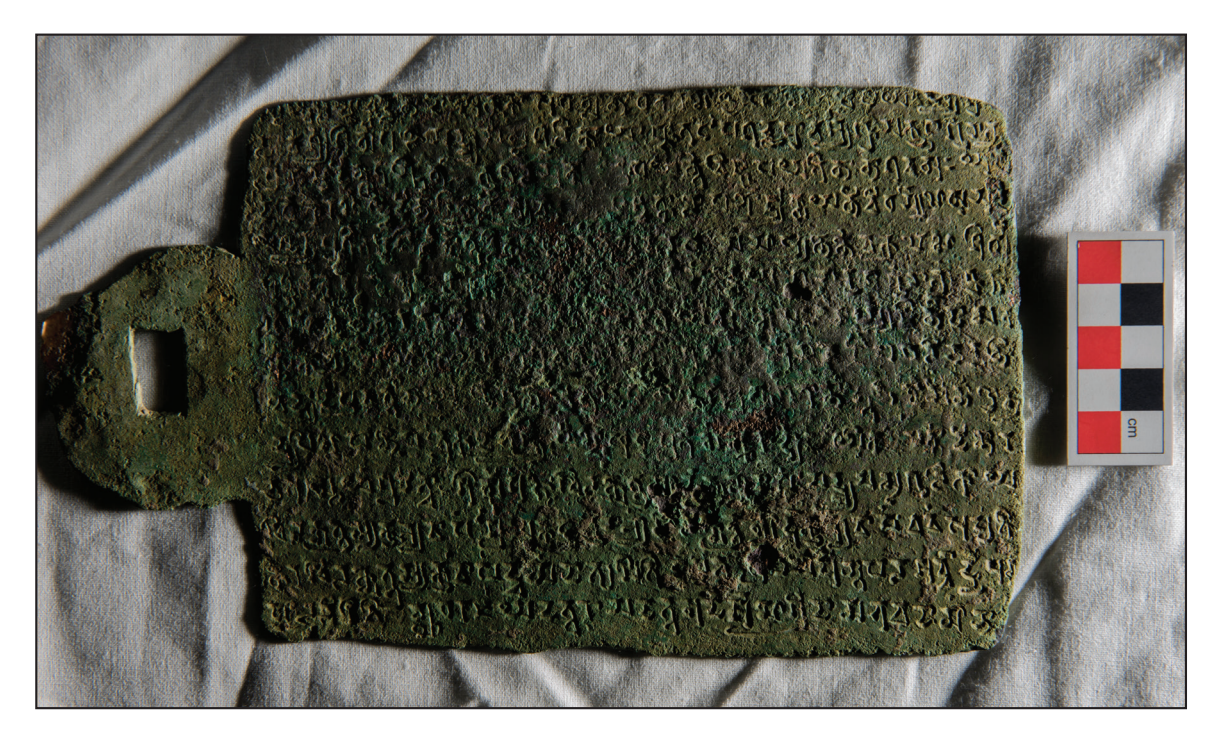
Pl. 12. Obverse of Nāgavasu's grant