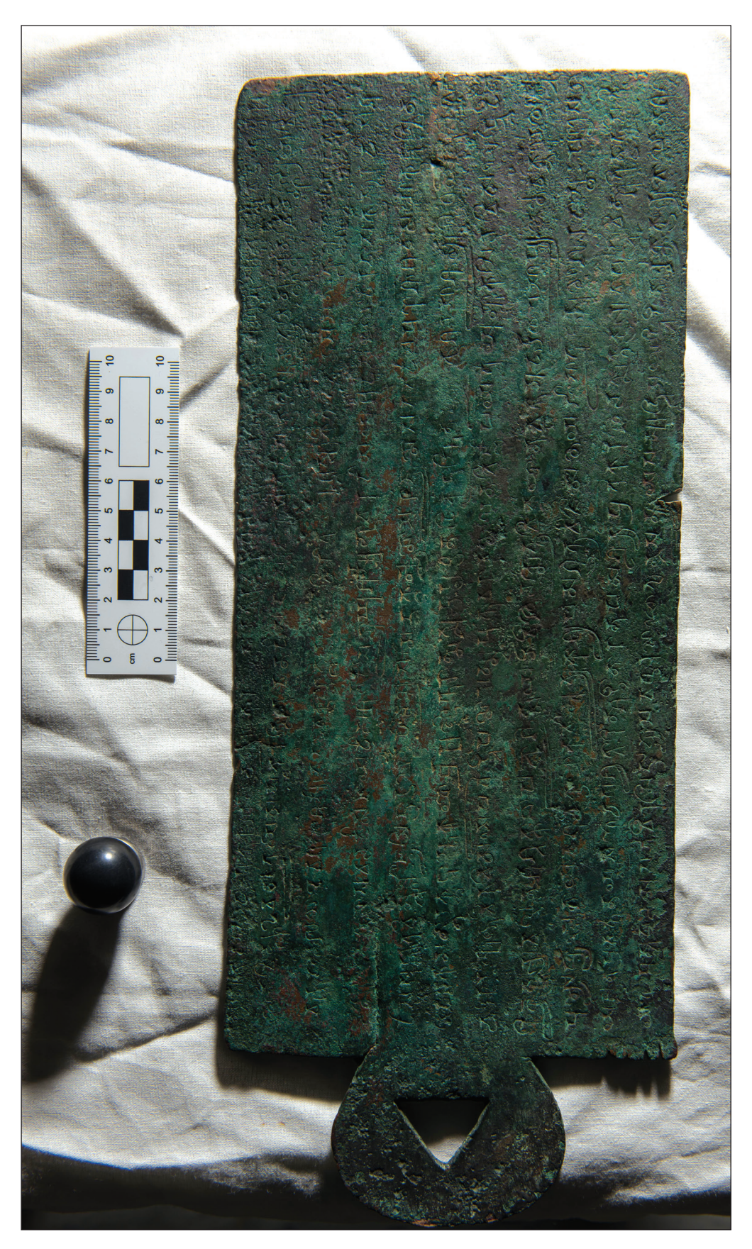
Pl. 8. Obverse of the T\bar{a}v\bar{\imath}ra grant in unfolded state (Photo James Miles, 2017)