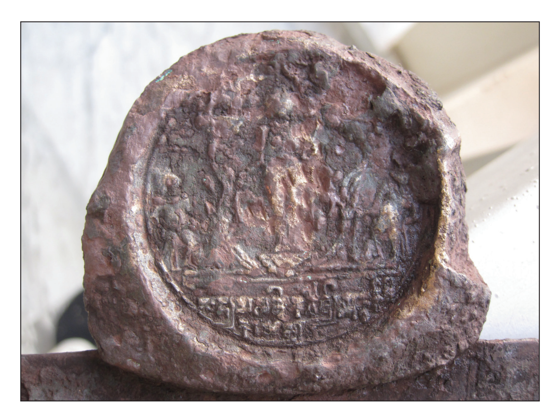
Pl. 2. Primary seal of the Raktamālā grant #2