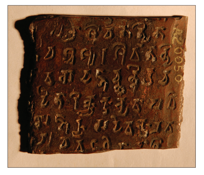
Pl. 14. Obverse of the fragment of a plate from Baigram