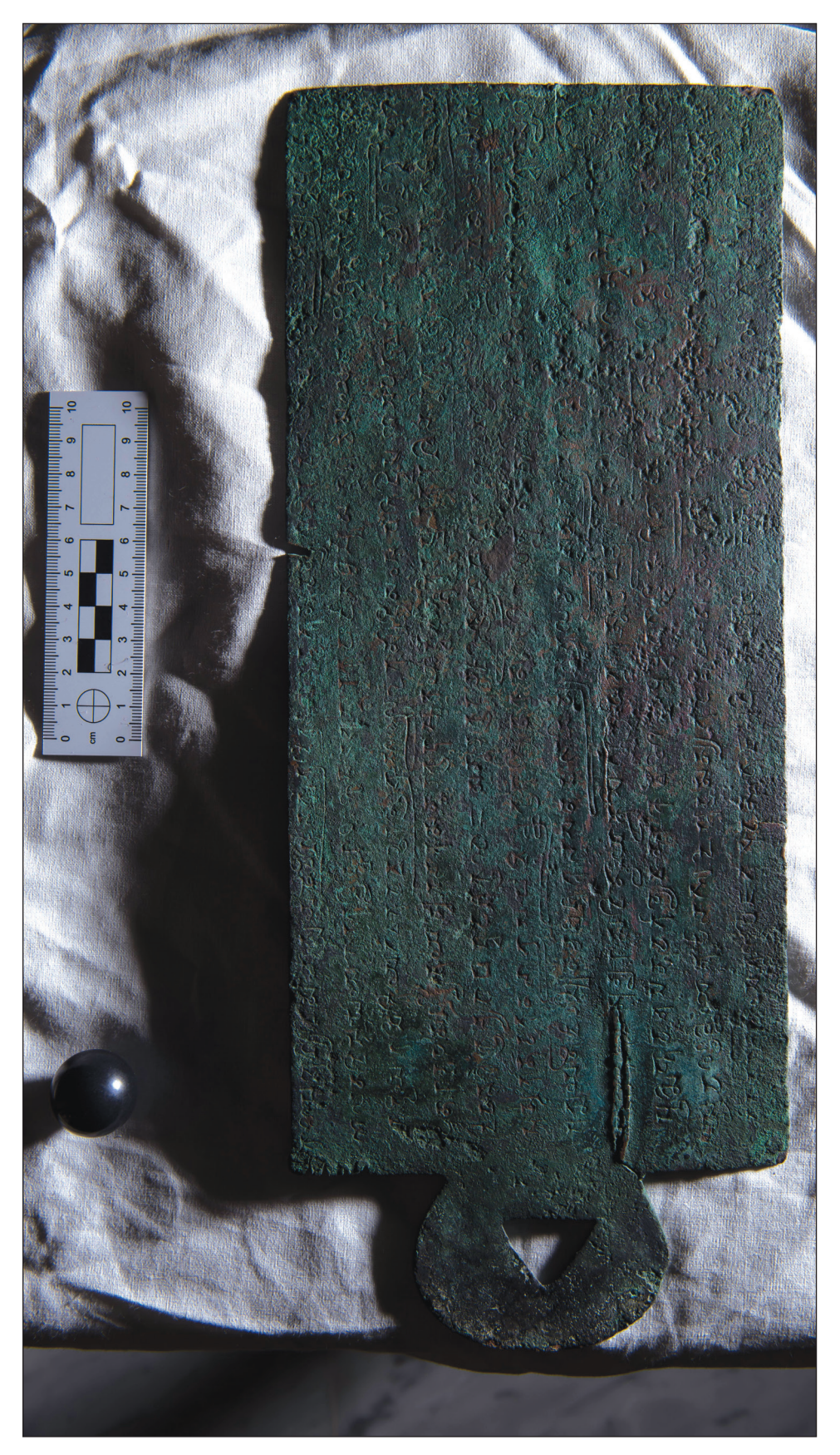
Pl. 9. Reverse of the Tāvāra grant in unfolded state