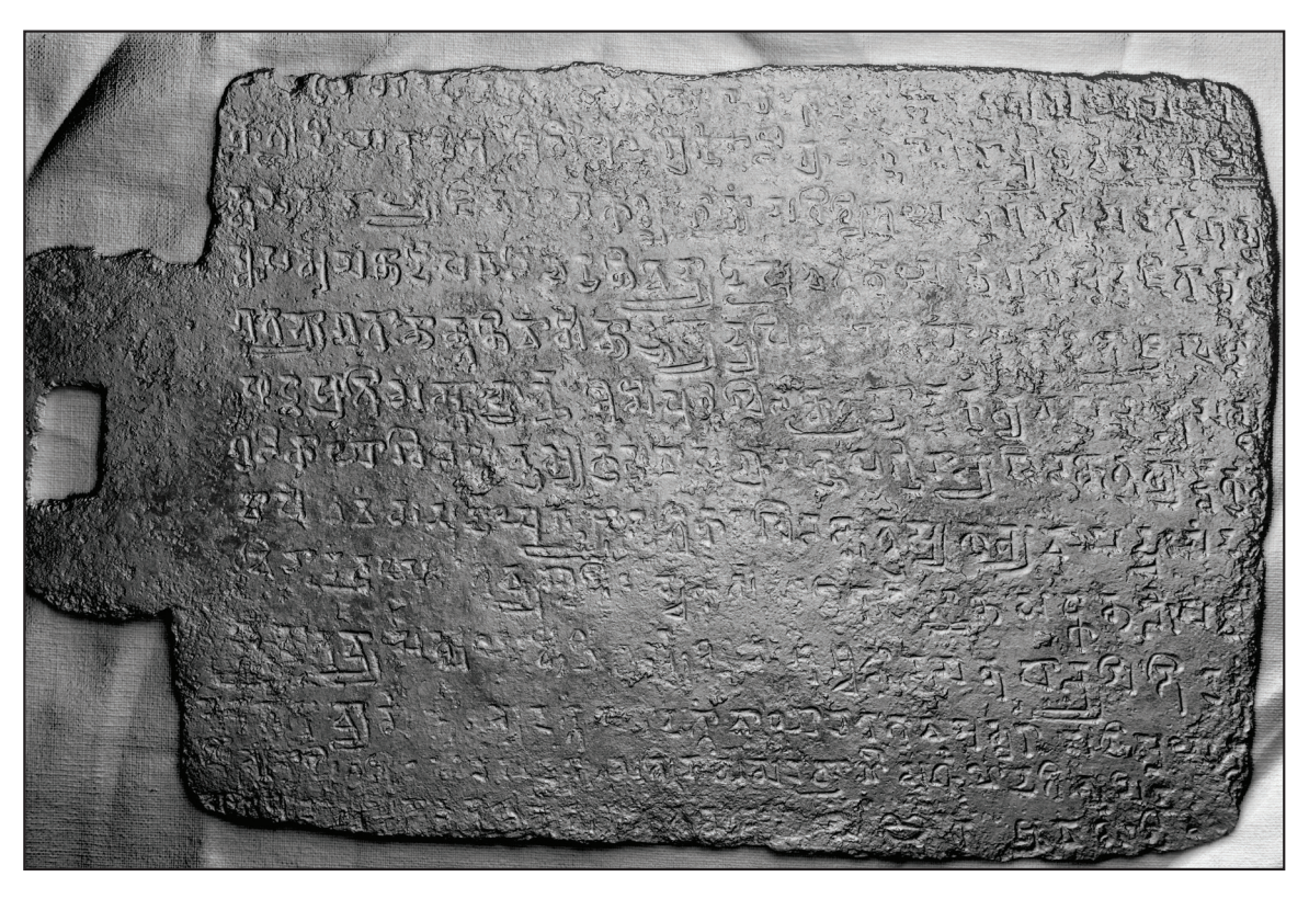
Pl. 13. Reverse of Nāgavasu's grant (Extract from RTI in specular enhancement mode, James Miles, 2017)