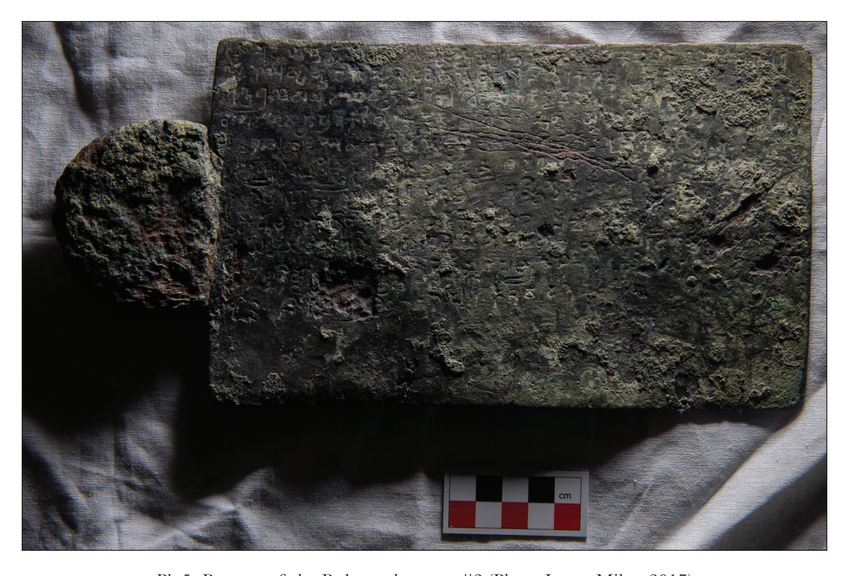
Pl. 5. Reverse of the Raktamālā grant #2