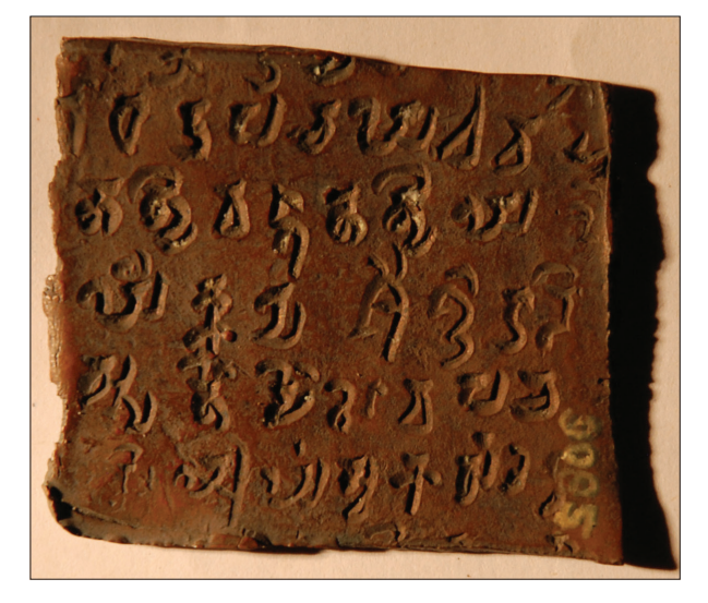
Pl. 15. Reverse of the fragment of a plate from Baigram

The contents, to the extent recoverable, reveal a clear connection with the published Baigram grant, because the name Sivanandin figures there too (as father of the purchasers Bhoyila and Bhāskara in Il. 3–4: āvayoḥ pittrā śivanandinā), as do the toponyms Vaṭagohālī and Śrīgohālī. It is remarkable that this fragment contains several incomplete aksaras—a kind of error not encountered with such frequency, if at all, in other inscriptions of the corpus. Nevertheless, the fragment is a valuable little scrap of information, revealing that the known Baigram plate must have been part of a hoard, that would have contained two or more plates forming the archive of a particular shrine or family, like the Damodarpur plates.