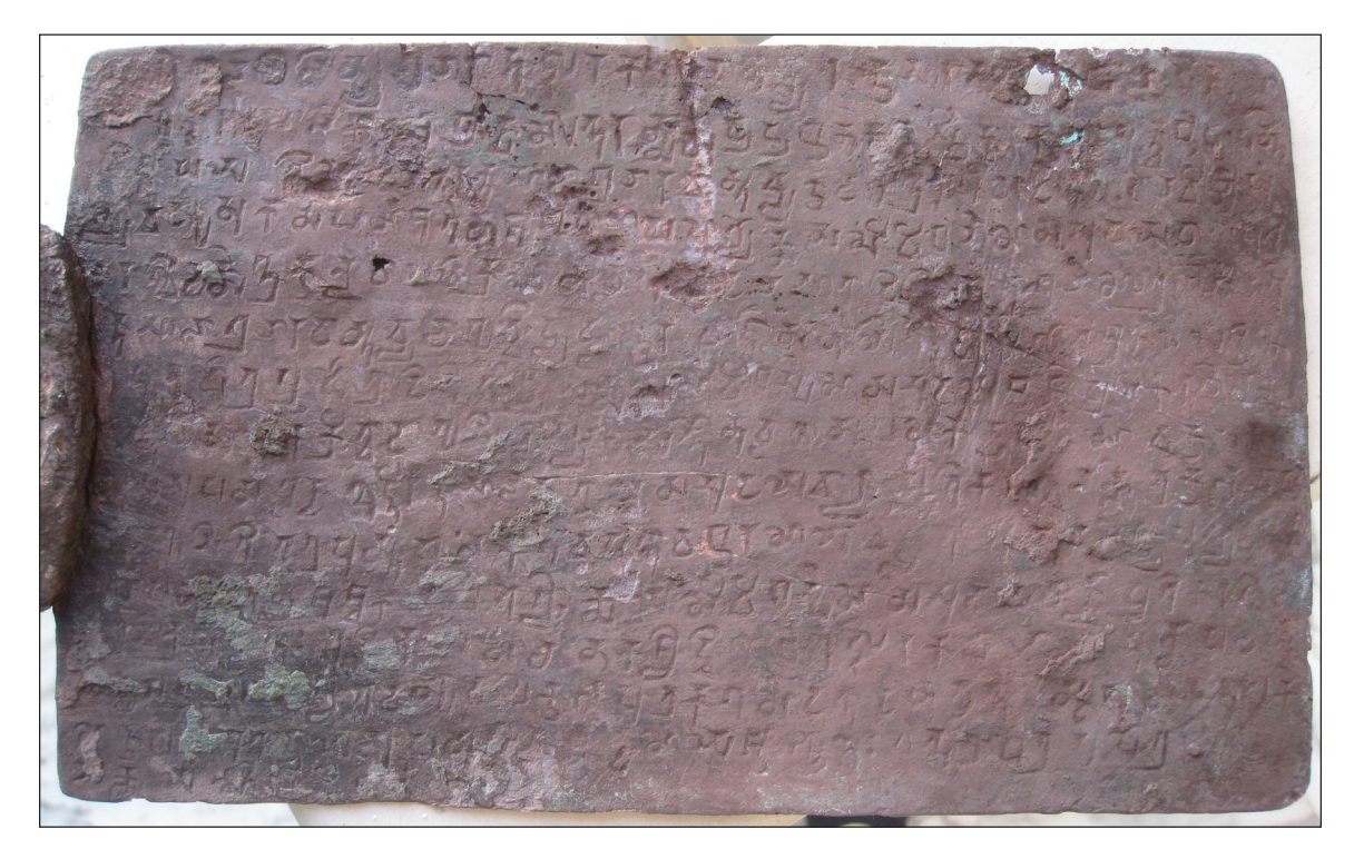
Pl. 4. Obverse of the Raktamālā grant #2 (Photo Arlo Griffiths, 2016)