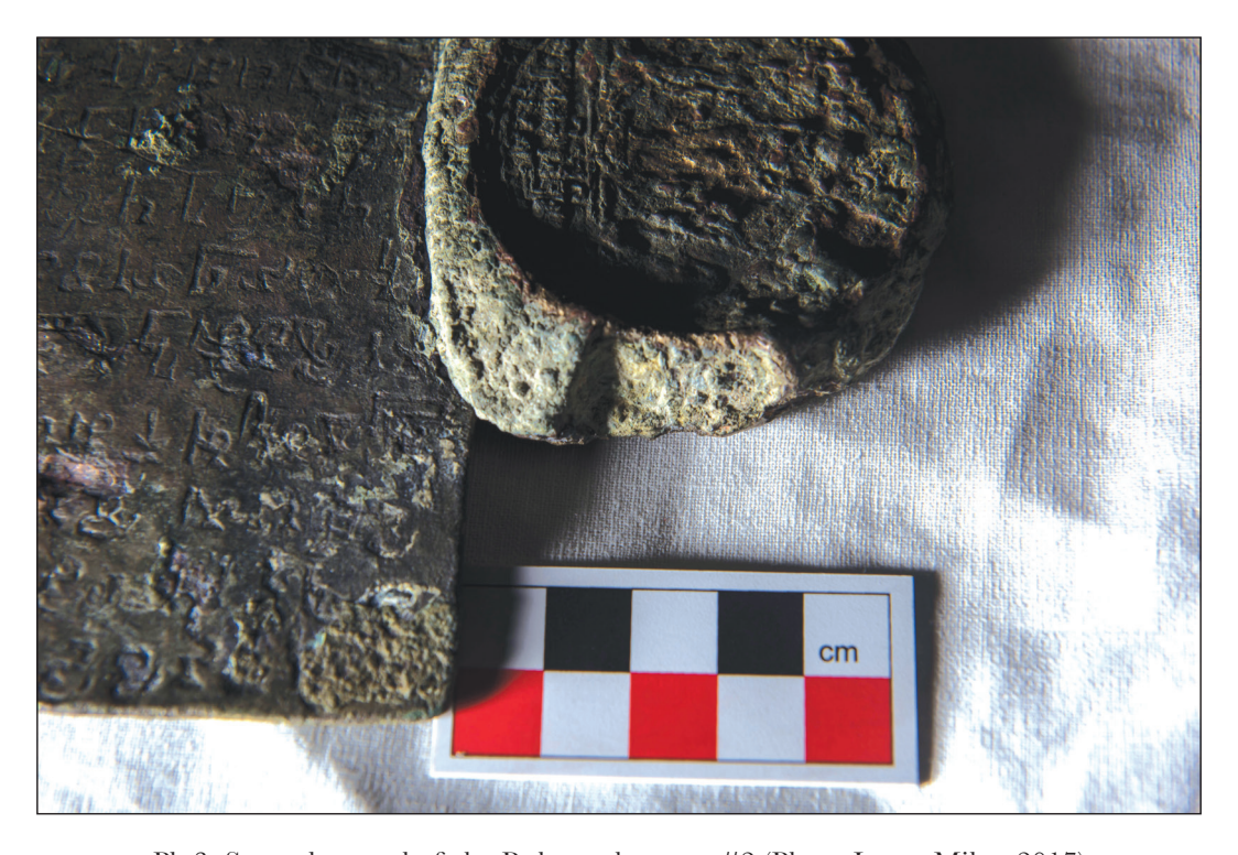
Pl. 3. Secondary seal of the Raktamālā grant #2