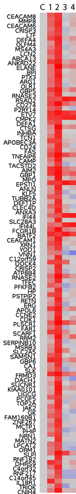
Figure 3 Genome-wide gene expression. Heatmap showing genome-wide expression array in patients with mutations in CECR1 and RNA-seq analysis in patients with mutations in SAMHD1 . Genes shown had a fold change greater than 5 (mean patients versus mean controls in the microarrays). Normalised expression levels for the microarray were expressed as fold change versus control samples in log scale. Similarly, for RNA-seq, normalised counts were expressed as fold change versus control samples in log scale. To generate the heatmap these log ratios (and control values of zero) were normalised between genes by setting the standard deviation of each gene to 1. Blue low expression, grey no change, red high expression. Samples shown: C = control; 1 = F785 patient 1 (ADA2); 2 = F750 patient 2 (ADA2); 3 = F104 (SAMHD1); 4 = F116 (SAMHD1).

particular nucleotide variant has been reported in the compound heterozygous state in one Turkish patient [9], and results in the same amino acid substitution as a Georgian Jewish founder mutation (c.139G > A) described previously [1]. This variant has not been seen in the EVS control database, is highly conserved and is predicted to be damaging (Additional file 1: Figure S2, Additional file 1: Table S2). Both parents were heterozygous for the variant. Interferon scores of 5.1, 7.0 and 3.3 were recorded at 6.73, 6.81 and 7.02 decimalised years of age respectively. Parental samples were not available for testing. A genome-wide expression array demonstrated marked upregulation of neutrophil-expressed genes (Figure 3), and these findings were confirmed on qPCR of a selection of 6 of the most upregulated genes identified in the array data (Figure 2).