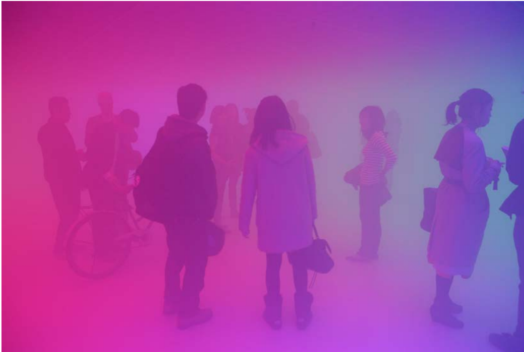
Feelings are Facts , 2010. Ullens Center for Contemporary Art, Beijing.