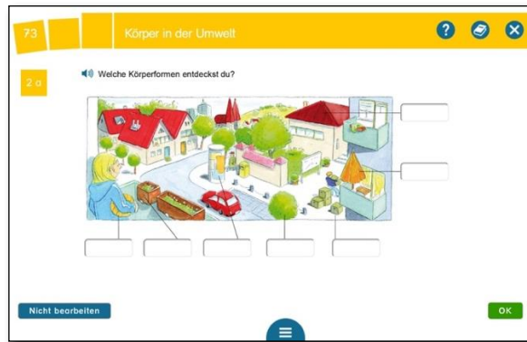
Figure 1: Task

the student entered the correct name of the solid in the correct spelling. The feedback does not differentiate between incorrect spelling mistakes or incorrect solid names.