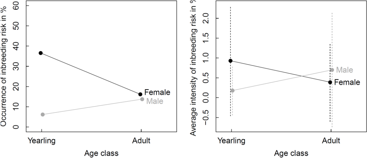
Figure 1. Sex differences in inbreeding risk. (a) Occurrence of inbreeding risk, scored as the percentage of mating seasons where a first order relative was present for yearlings and for adults. Females are depicted in black (n=90) and males in grey (n=116). (b) Intensity of inbreeding risk, scored as the average proportion of first order relatives in the mating pool of yearlings and adults. Females are depicted in black (n=90) and males in grey (n=116). Dashed error bars indicate standard deviations.