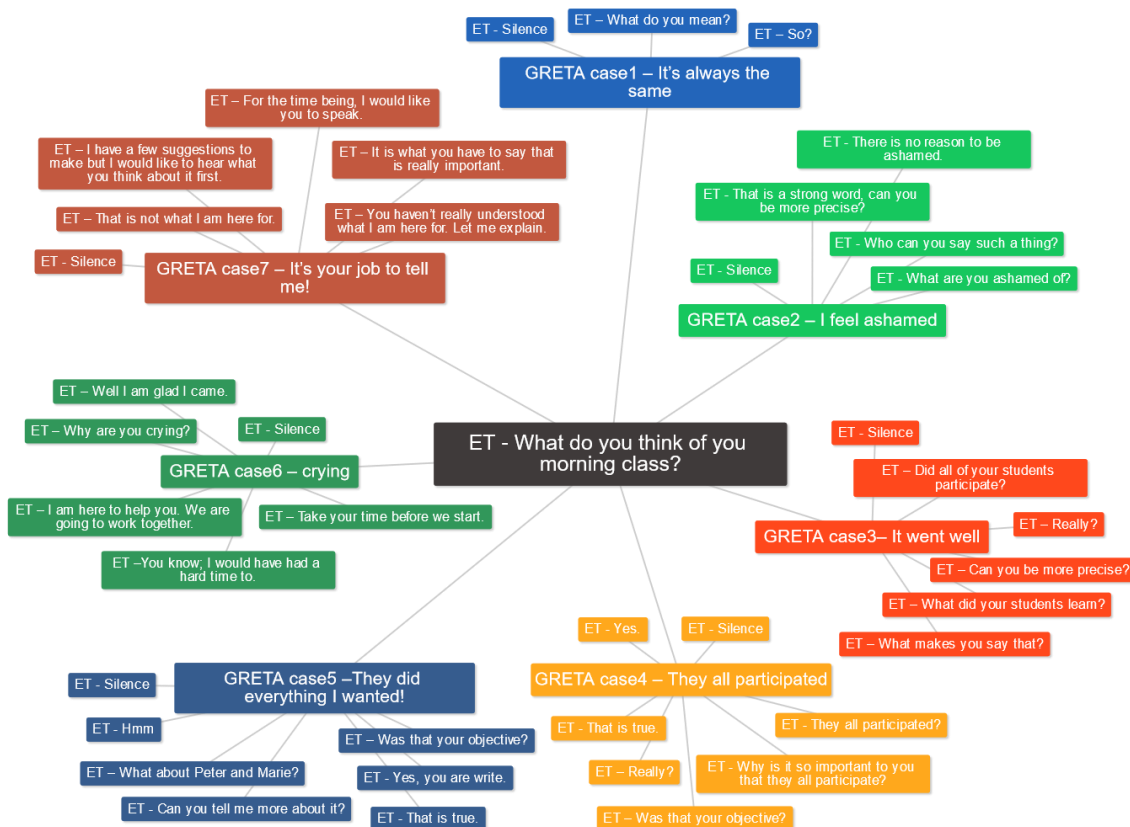
Figure 3. scenarios for the introductory phase of an interview between Educational Trainers (ET) and novice teachers (played by a GRETA virtual agent)