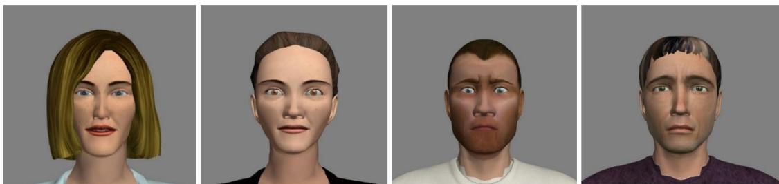
Figure 2. four GRETA agents: Poppy, Prudence, Spike and Obadiah

The TGRIS setting presented above was also co-designed with the ETs' teacher. The possibility to record the interview simulation and play them back during a debriefing session was especially important to her as a large part of her teaching method is based on analyzing interviews. She even mentioned the possibility of letting the ETs pilot the agent in order to mimic novice teachers they had interviewed.