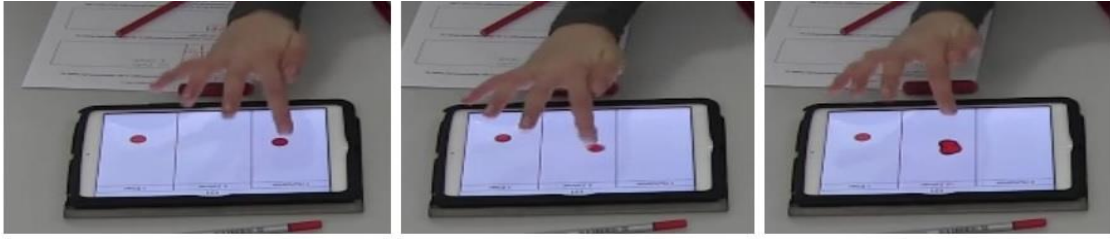
Figure 2: De-bundling as dragging from hundreds to tens

In this scene of practical dragging the newly emerged bunch of ten tokens in the tens' column can be seen as an iconic sign representing ten tens and therefore the number 100. Additionally the bunch of ten tokens refers back to the action of dragging a token from the hundreds' column to the tens' column on the DPC and at the same time to the DPC's reaction by letting the token explode into ten tokens without changing the represented number (concept of de-bundling). Thus, a new sign emerged by indexation linking the action of dragging on the DPC with a visual representation of de-bundling. This in turn produced a reaction of astonishment expressed by Bella ("Woah"), again referring back to the DPC's reaction on her dragging.