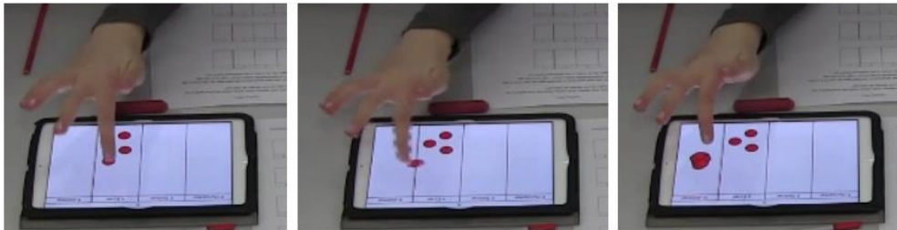
Figure 4: De-bundling ones to tenths by dragging

In this scene Bella intentionally exploits the DPC's function of de-bundling to get insights into the relation between ones and tenths (lines 3 & 7). Thus, the two dragging-gestures (lines 3 & 7) as well as the dragging-action (line 5) represent operational dragging. From the perspective of indexicality, both dragging-gestures from left to right (acc. to the view of the students) can be assumed to be linked to previous actions of dragging from left to right on the DPC and their traces, because of the close resemblance between gesture and action. By this, dragging-gestures become indices of dragging-actions including the experiences and assumptions that have been made by dragging tokens on the DPC from left to right, e.g.: "when I drag a token to the right, the number of tokens changes / increases" or "when I drag a token to the right, the represented number remains the same".