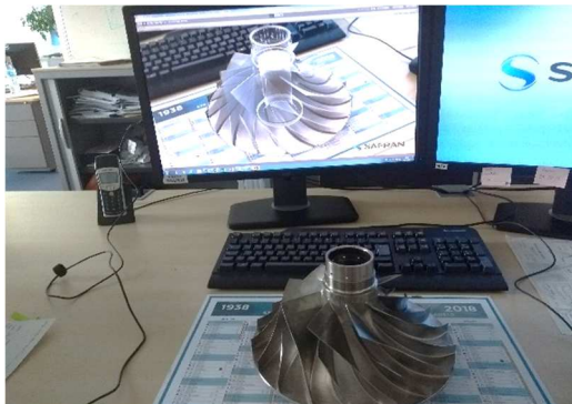
The work station of the demonstrator

The demonstrator has been made using a 720p webcam, Unity, Vuforia and its Model Target feature. It focuses on the laying of strain gauges on a centrifugal impeller. After creating the Model Target file, the digital mock-up of the part is superimposed on the real part and a sight represents the requested position of the gauge.