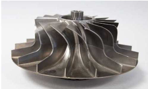
A centrifugal impeller

then set the sensors to the requested position. When instrumenting complex-shaped parts such as centrifugal impeller, it becomes difficult to defer the dimensions.