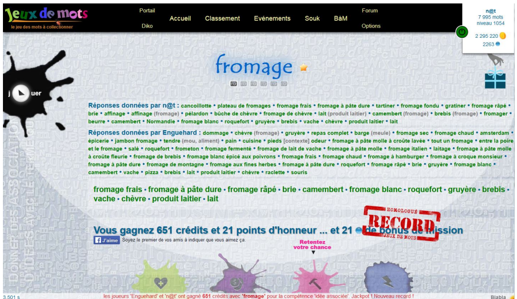
Figure 2: Screenshot of the game result with the target noun fromage . Proposals of both players are displayed, along with points won by both