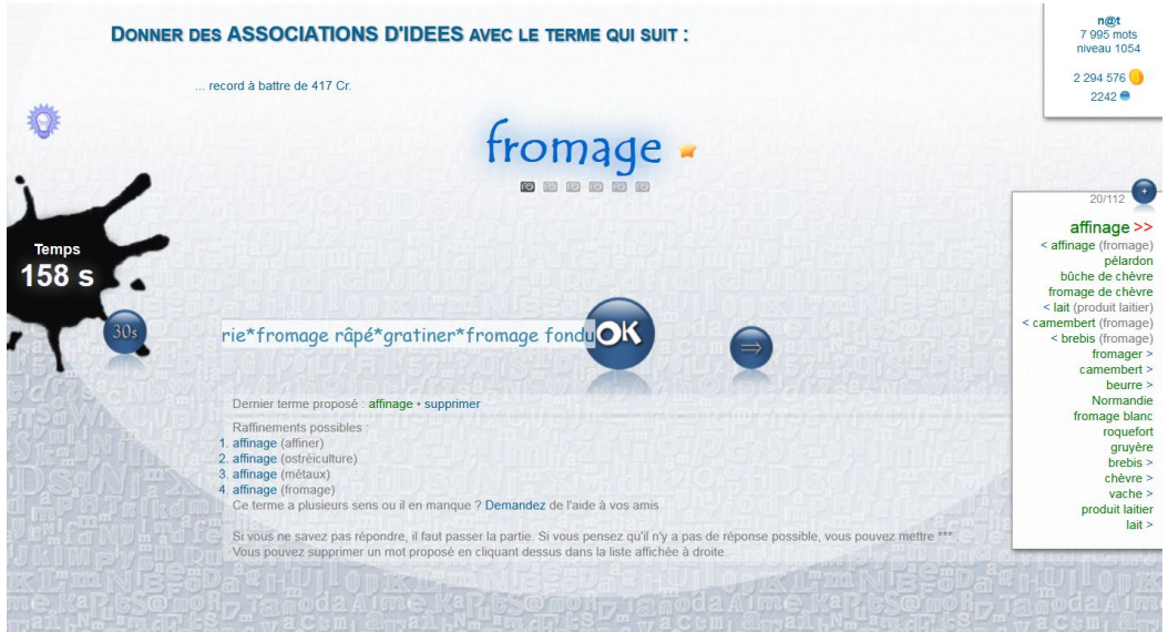
Figure 1: Screenshot of an ongoing game with the target verb fromage (cheese). Several propositions have been given by the user and are listed on the right hand side